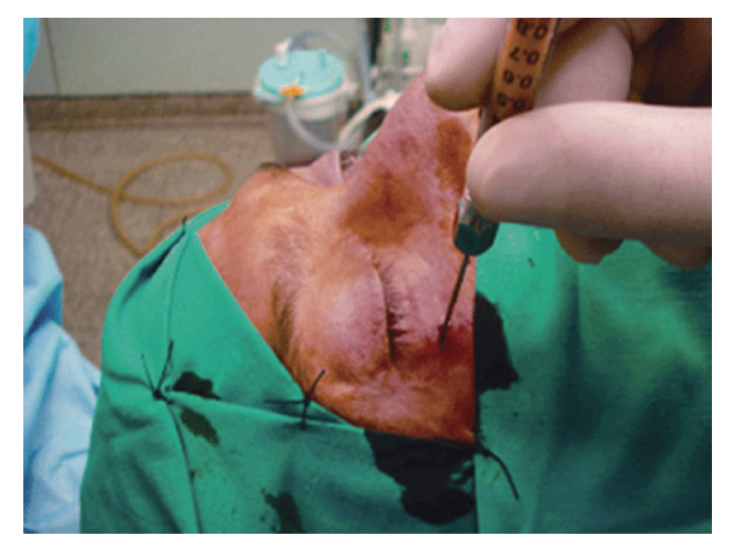
Figure 4: Minimally invasive autologous fat injection: atraumatic suction, furification, and reinjection in the orbit using a cannula. Adapted from Cervelli et al. <sup>[50]</sup>

available for craniofacial surgery since the 1990s. As opposed to porous polyethylene, HA is more fragile, more expensive, and not as easily shaped intraoperatively.<sup>[34]</sup> HA appears to have a higher risk of postoperative enophthalmos than medpor.<sup>[35]</sup> Bioactive glasses (BAGs) are synthetic blocks or granules that bond chemically to bone. Despite the fact that BAGs are of brittle nature and hard to mould and shape, they are osteoinductive and osteoconductive.<sup>[36-38]</sup> They can prompt the repair of bone with minimal foreign body reaction, infection, extrusion and resorption.<sup>[39]</sup>