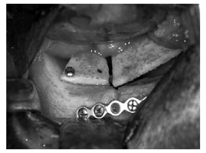
Figure 1: Multiple small plates of calvarial bone and screws were used to re-create the normal contour of the orbit. Adapted from Gunarajah and Samman<sup>[6]</sup>

Biological materials including autografts, allografts, and xenografts, are defined as grafts harvested from the same body, from cadavers or from animals. Generally speaking, autologous grafts are characterized by cost-effectiveness but limited availability, variable resorption rates resulting in unpredictable orbital volume that may lead to enophthalmos, associated donor site morbidity (pain, scarring, infection, haematoma), as well as an increased surgical time. Autologous bone was the first material used to reconstruct the orbit and remains popular today. Since the 18th century, it has been the "gold standard" biomaterial for the reconstruction of craniofacial bony defects.<sup>[9,10]</sup> The major donor sites include crista iliaca, calvarium, maxilla and mandible.<sup>[11-14]</sup> Autologous bone graft is applied in orbital reconstruction because of its strength, rigidity, biocompatibility, vascularization potential, and incorporation into the orbital tissue with minimal acute and chronic immune reactivity. The advantages mentioned above make it a significant role in the stage of orbital