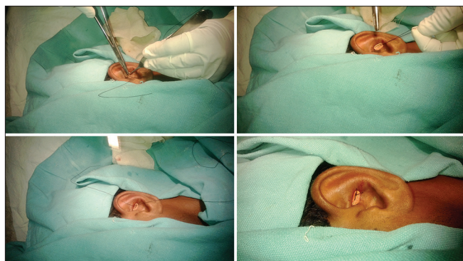
Figure 2: Placement of the corrugated rubber drain