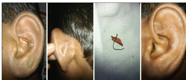
Figure 3: The pinna on follow-up