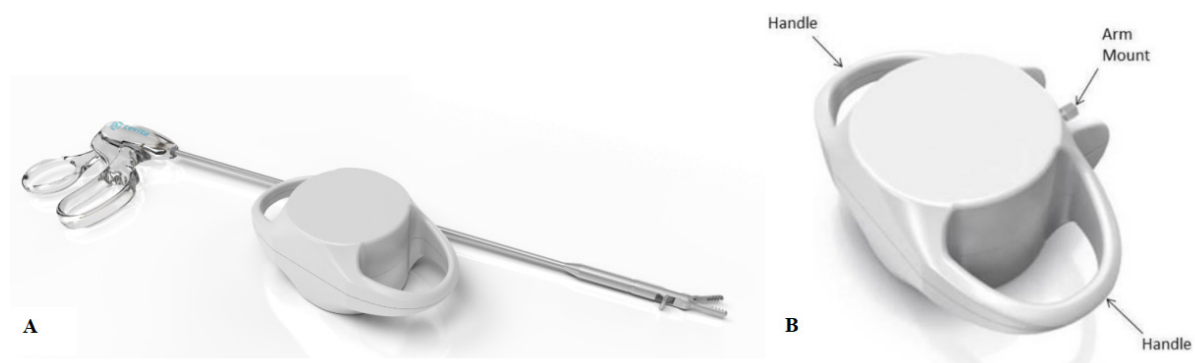
Figure 1. Magnetic surgical system (Levita Magnetics, Menlo Park, CA). (A) Magnetic grasper. (B) Magnetic controller.

A total of 50 patients with a mean BMI of 27 kg/m 2 underwent a 3-port laparoscopic cholecystectomy with the assistance of the MSS at three different hospitals. The average procedure time was 63 min, with 90% of the surgeons reporting “excellent” exposure. There were no device malfunctions, major complications, or serious adverse events related to the device. Although no external abdominal wall abnormalities were noted, in 38% of the patients, internal petechiae were noted and presumed to be related to the magnetic device without clinical significance. The authors concluded that MSS is safe and feasible as the study met the outlined endpoint criteria [18] .