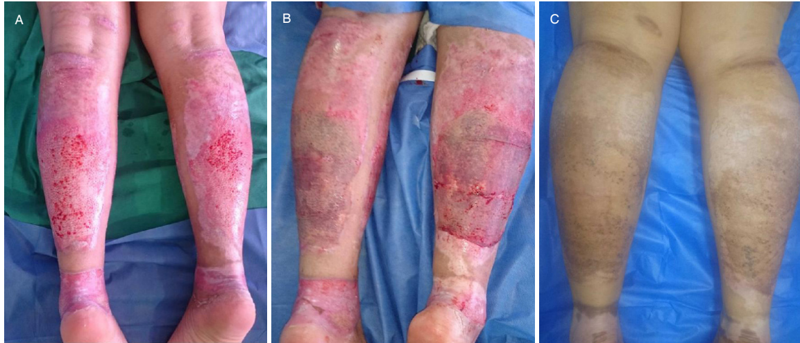
Figure 5. A: Thirty-two-year-old female patient with a deep partial-thickness flame burn to both lower limbs, who underwent eschar removal by tangential excision; B: placement of split-thickness skin grafts transversely; C: results at postoperative year 1. No evidence of contracture, and both texture and color are adequate