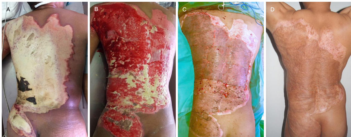
Figure 6. A: Twenty-eight-year-old male patient with a full-thickness flame burn of 18% total body surface area to back and gluteal region; B: appearance following 3 escharectomies performed by electric dermatome, and temporary coverage with skin allografts; C: intraoperative appearance after placing split-thickness skin grafts transversely; D: results at postoperative month 12

or muscle contractures, or functional limitations of involved joints; however, they reported persistence of pain at rest and during activity, decreased joint ROM, decrease in strength, and ADLs limitations, which improved at week 6 following surgical contracture release by placing new grafts and restarting rehabilitation.