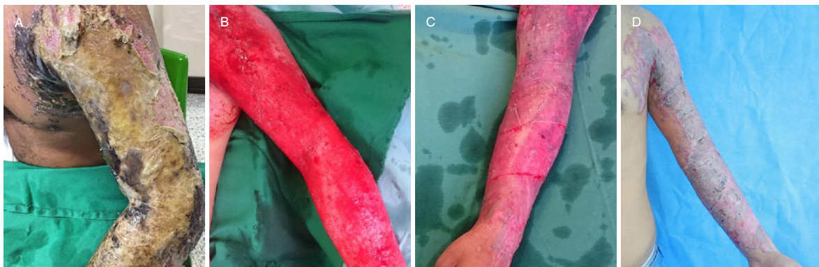
Figure 4. A 24-year-old male patient with a full-thickness chemical burn (sulfuric acid) to the left upper limb, involving creases. A: Initial appearance, with an adhered and hard eschar; B: formation of a uniform and non-hypertrophic granulation tissue. It was red and had no discharge following two escharectomies. It was covered temporarily with skin allografts; C: placement of split-thickness skin grafts transversely soon after surgery; D: appearance at postoperative month 1

joints, pain degree, and presence and severity of edema, resulting in functional limitation of the involved joint. Sensitivity exhibited mixed impairment, with areas of hyperesthesia associated with superficial burns and areas of hypoesthesia associated with deep burns, as well as non-painful areas corresponding to full-thickness burns. Patients showed decrease in strength, range of motion (ROM) impairment and activities of daily living (ADLs) limitations. This resulted in weakened or non-functional upper and lower limbs, making patients highly dependent.