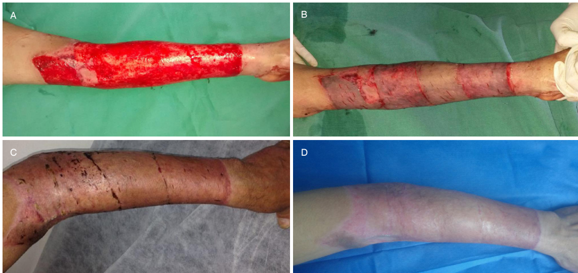
Figure 3. A 16-year-old female patient with a full-thickness flame burn to the left upper limb. A: Exposed area suitable for grafts; B: coverage with split-thickness skin grafts placed transversely; C: appearance by postoperative day 45; D: appearance after 6 months, with no functional limitations