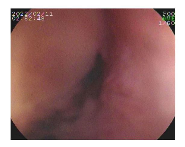
Figure 1. Double-balloon upper endoscopy demonstrated a mucosal defect in the 3rd portion of the duodenum suggestive of a sinus tract. This area was clipped to mark the anatomic location. Computed tomography angiogram following endoscopy demonstrated a diverticulum immediately adjacent to the clip suggestive of a small aorto-enteric fistula