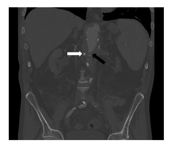
Figure 2. After placement of a metallic clip in the duodenum at the visualized lesion, a computed tomography angiogram demonstrated a diverticulum of the aortic stump (black arrow) near the duodenal clip (white arrow) concerning for another aorto-enteric fistula