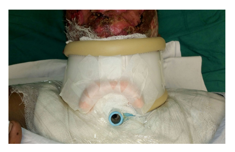
Figure 4. Patient wearing modified neck collar

were able to provide tracheostomy care easily with the modified cervical splint in situ . During recovery phase wounds were managed with regular hydrojet debridement, low level laser therapy, autologous platelet rich plasma therapy, insulin therapy and regulated oxygenation and negative pressure wound therapy. Once the wound bed became healthy autologous split skin graft was applied [Figure 6]. Patient responded well to the treatment and neck wounds are healing well. Graft take is adequate and there is no restriction in range of motion of neck [Figure 7]. Once the edema settled, planned weaning from the tracheostomy and decanulation has been done during recovery phase. Modified neck splint was applied after tracheostomy removal also. At present the patient is following same neck splint and having no complaint of discomfort.