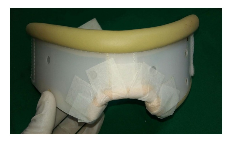
Figure 1. The modified neck splint