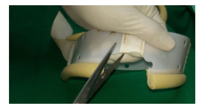
Figure 3. Preparing the modified neck splint