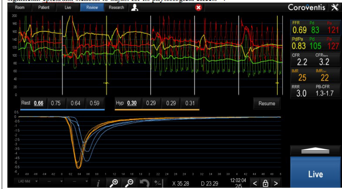
Figure 2. Measurement of IMR (and FFR). Note that Steps 1-8 are common to both FFR and IMR measurement. Steps 9-11 are additional steps required to measure IMR. IMR: Index of microcirculatory resistance; FFR: fractional flow reserve.