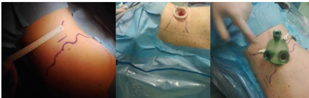
Figure 2. The 2.5 cm incision at the tip of the 12th rib and single-site gel port GelPOINT® Advanced Access Platform (Applied Medical, Rancho Santa Margarita, CA, USA).