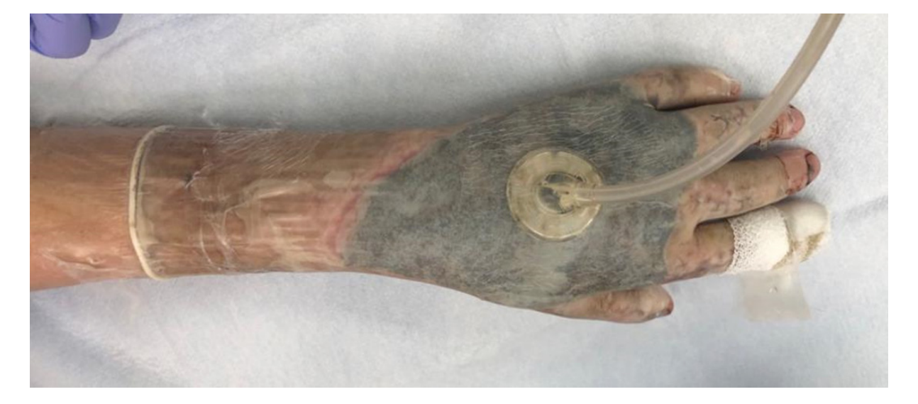
Figure 1. Negative pressure wound therapy can be used despite difficult-to-seal webspaces with the use of a sterile surgical glove

made at this step to minimize the wound dimensions and/or depth. This often requires multiple trips to the operating room for serial debridement, particularly in the case of farming injuries or motor vehicle accidents with significant environmental debris, as the extent of contamination and devitalization may not be immediately evident at the index procedure.