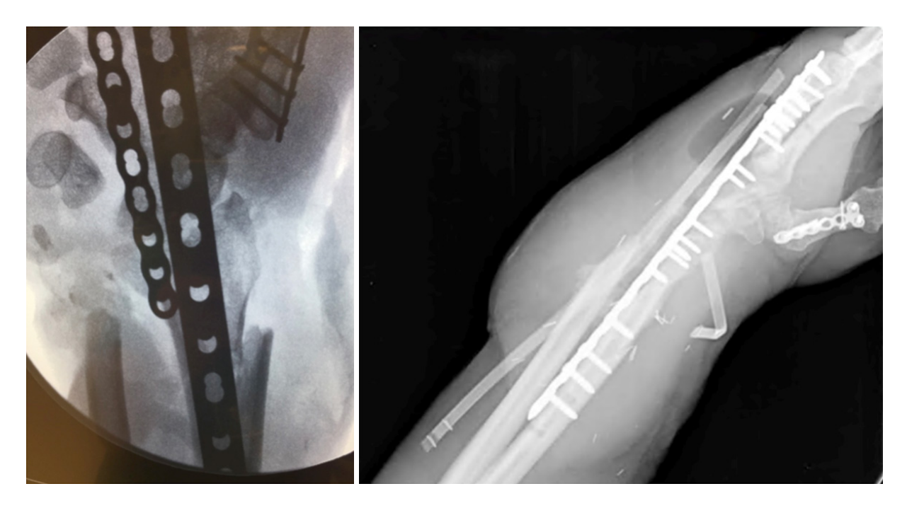
Figure 7. Arthrodesis of carpometacarpal, midcarpal, and radiocarpal joints with dual plate fixation for control of unstable carpal bones and distal radial fracture. Hardware seen on thumb metacarpal was present from previous injury

that was transferred from the right side to the left dorsal wrist and hand and covered with a split thickness skin graft [Figure 8].