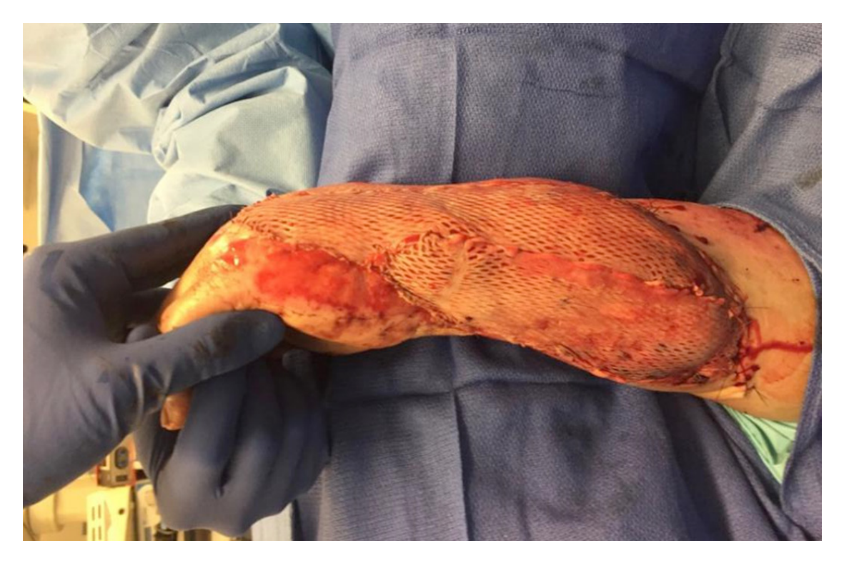
Figure 8. Free latissimus dorsi muscle flap to the defect followed by skin-thickness skin grafting of the muscle belly