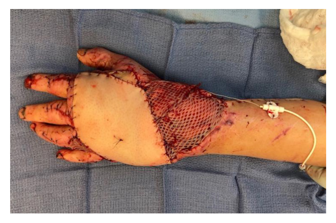
Figure 3. Free antero-lateral thigh flap with split thickness skin graft as well as cement spacers to the metacarpophalangeal joints of index through small fingers. Seen in the photograph is the implantable Synovis Flow Coupler (Baxter, Birmingham, AL) device for postoperative monitoring purposes