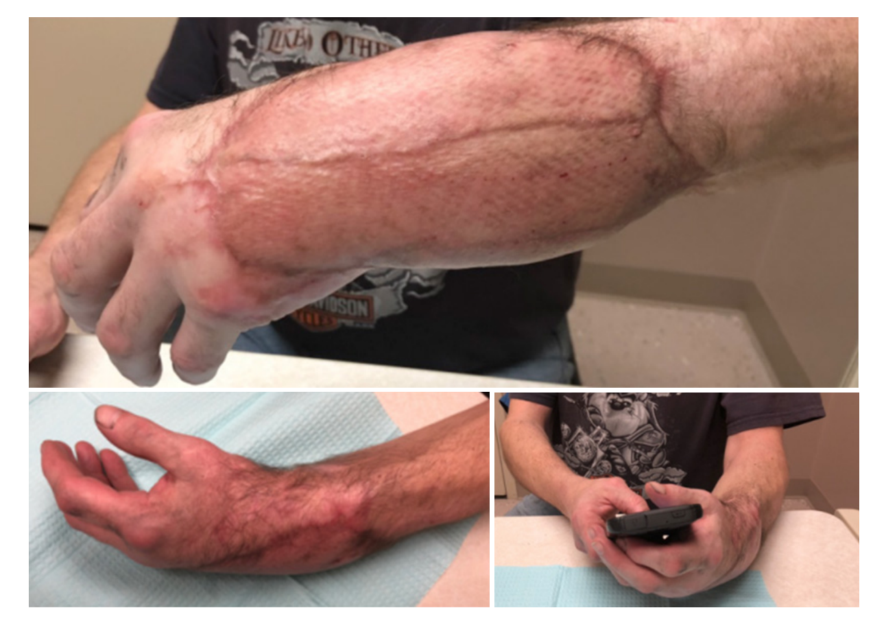
Figure 10. Four months postoperative follow-up showing atrophy of the latissimus muscle with improved contouring and use of the reconstructed hand for activities of daily living

EPL stump, one split to the index and long extensors, and one split to the ring and small extensors) [Figure 9]. These were placed directly on the hardware beneath the muscle flap. The flap contoured nicely to the dorsal of the hand and wrist, and the arthrodesis achieved bony union by three months [Figure 10]. At latest follow up, the second stage extensor tendon reconstruction has been delayed secondary to unplanned incarceration of the patient.