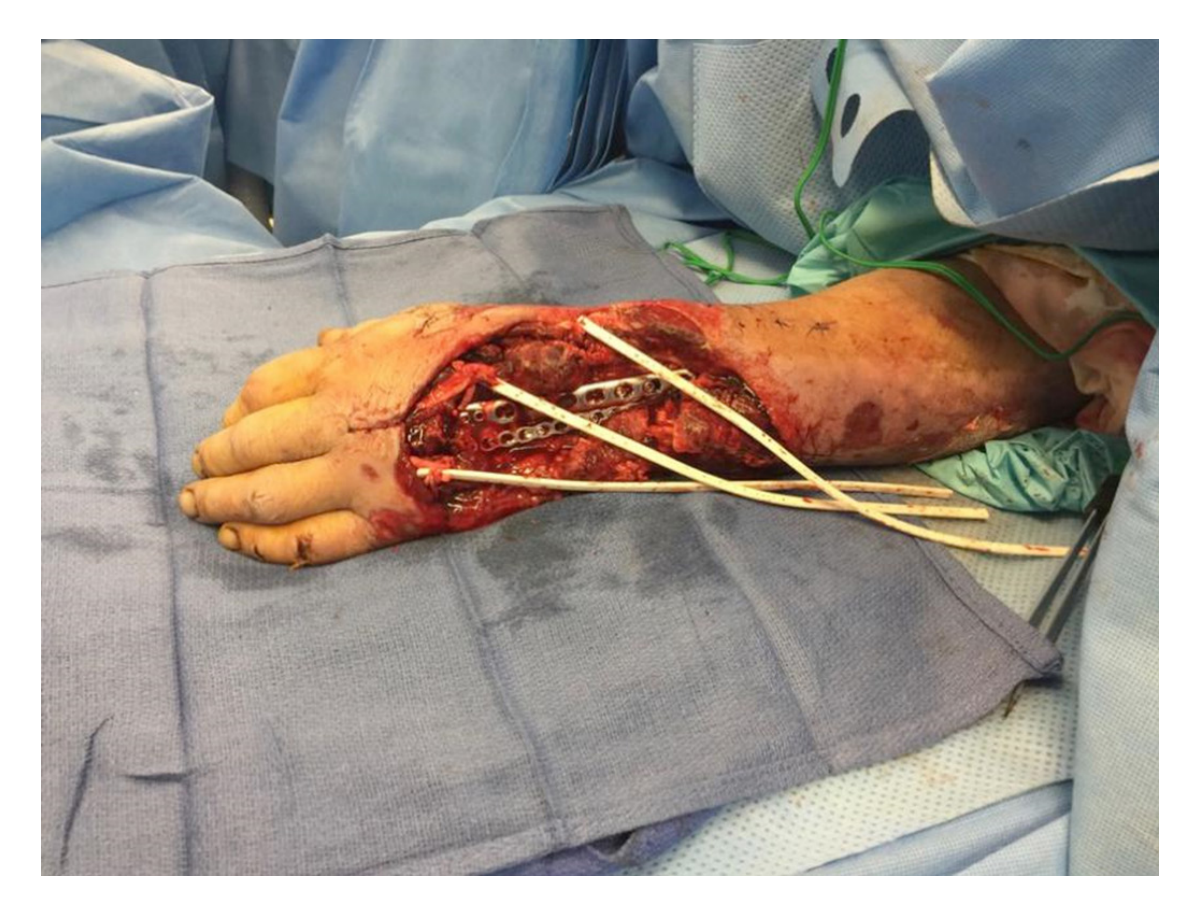
Figure 9. First stage extensor tendon reconstruction with silastic hunter tendon implants (Wright Medical Technology, Memphis, TN) to the extensor hood mechanisms distally