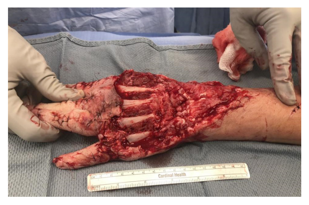
Figure 2. Following debridement, extensive destruction of the soft tissue envelope, extensor tendons (extensor digitorum communis, extensor indicis, and extensor digiti minimi), and metacarpophalangeal joints is noted