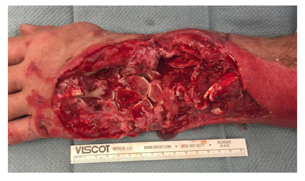
Figure 6. Following thorough extensive debridement of non-vitalized tissues and bone resulting in large wound with exposed bony defects, carpal instability, and extensor tendon loss