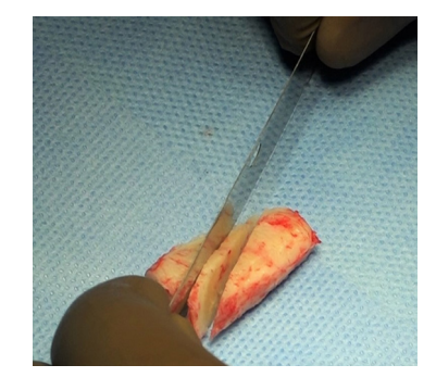
Figure 11. Cutting harvested cartilage according to oblique split method

Numerous clinical cases have shown that a cross-sectional graft obtained through an oblique cut to the long axis of the rib results in a graft with equal circumferential forces of contracture that have a decreased chance of warping<sup>[8]</sup>.