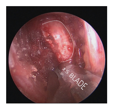
Figure 5. Perichondrial flap