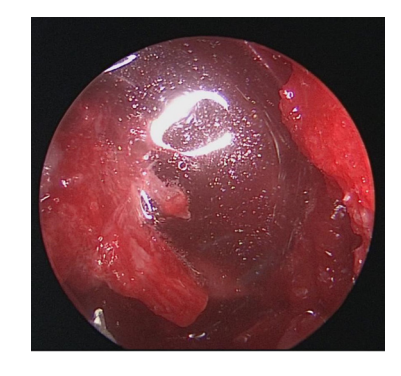
Figure 9. Insufflation test - filling the wound with saline solution