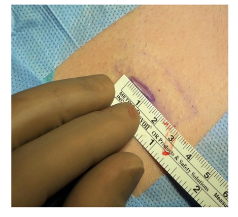
Figure 1. Incision 1.2 cm in length