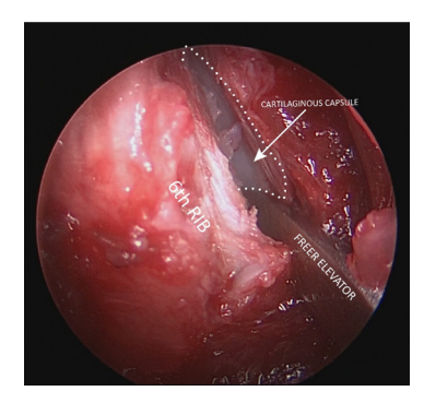
Figure 6. Elevation of the perichondrium

Then, we are making a so-called "window" incision to the perichondrium - creating a quadrangular perichondrial flap, with its 3 from 4 sides incised [Figure 5].