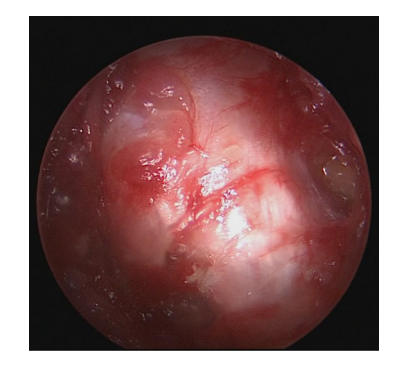
Figure 4. Clear visualization of the perichondrium with the help of endoscope