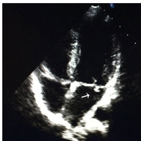
Figure 2: Transthoracic echocardiography showed there was a vegetation (10 mm × 4 mm) attached to mitral valves