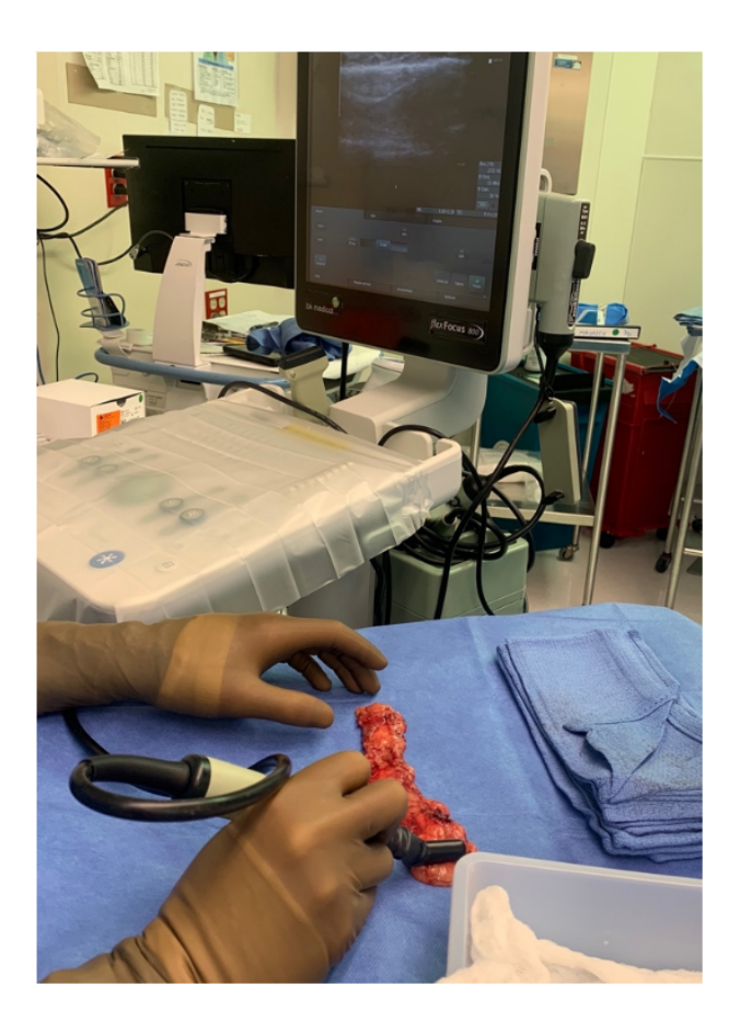
Figure 1. Intraoperative duplex ultrasonography of the gastroepiploic omental lymph node flap for the quantification of transferred lymph nodes.

interpreted by an attending radiologist (Tsai LL).