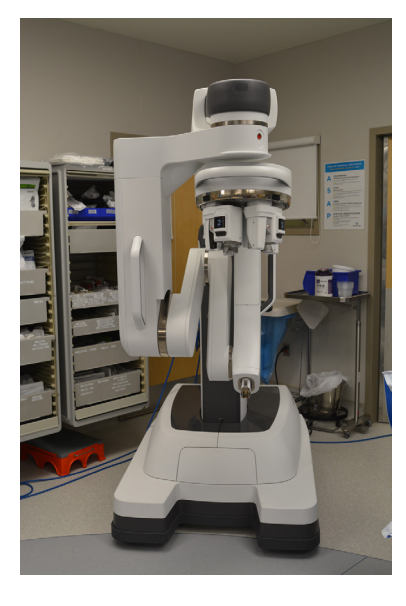
Figure 4. Single port robotic platform