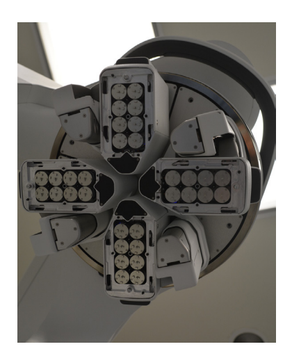
Figure 6. Single port instrument insertion platform

Figure 5. Angulation of single port robotic instruments employed through the single port trocar