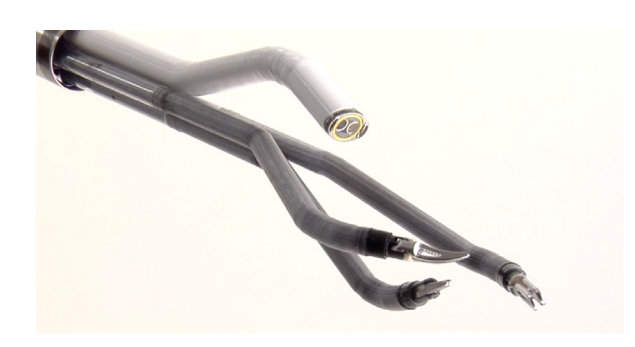
Figure 5. Angulation of single port robotic instruments employed through the single port trocar