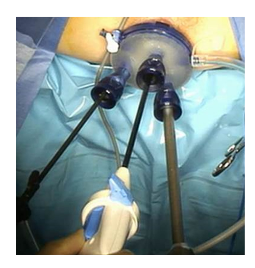
Figure 3. Transanal minimally invasive surgery platform inserted transanally

outlining the critical views for pure NOTES proctosigmoidectomy via TAMIS. While these advancements highlight what can be achieved transanally by highly experienced surgeons with single port laparoscopy, the ergonomics and technical challenges of these approaches resulted in limited adoption of these techniques.