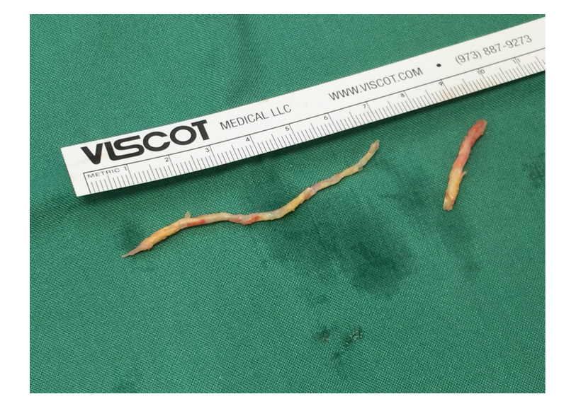
Figure 1. endarterectomy