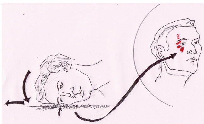
Figure 4: Schematic diagram representing soft tissue defect on the right side of the face following a road traffic accident

coverage which addresses all three defects simultaneously while preventing functional deficit and distortion of the adjacent tissue. The ideal reconstruction should avoid creating a “trap door” deformity, dog ear formation, ectropion, and sideburn displacement. [1]