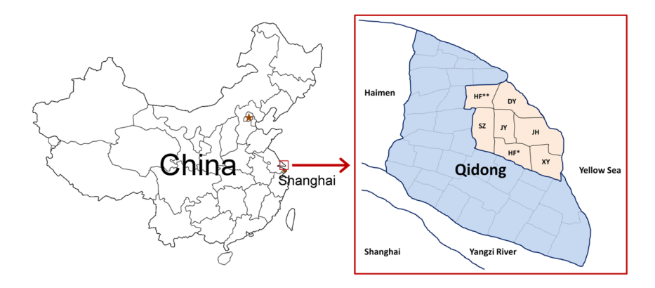
Figure 1. Location of the participants in the Qidong hepatitis B virus infection cohort