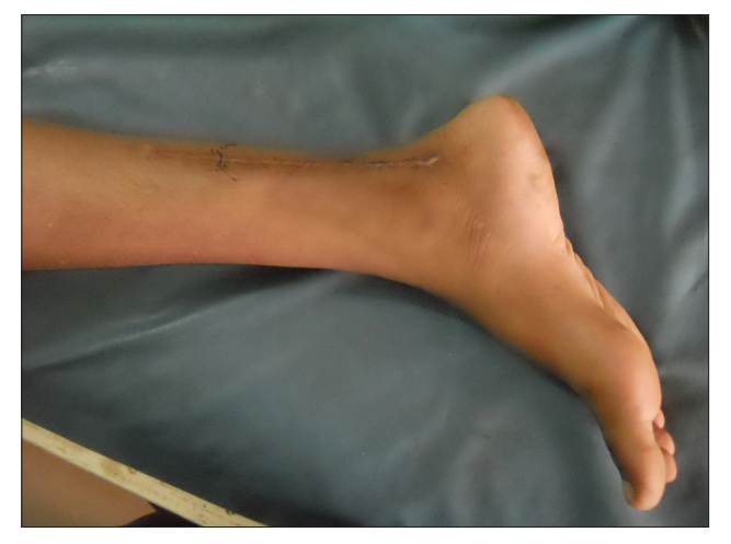
Figure 4: Picture taken after 3 weeks. The mark indicated the level of tunnels at that time. The wound has healed well