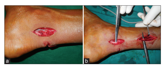
Figure 2: (a) On exploration, the soft tissue structure was found to be the posterior tibial nerve; (b) the nerve was explored in the leg and the nerve was found to have got avulsed from the middle third of the leg

The actual site of nerve injury was much higher than perceived site of injury, possibly a relatively fixed point like a muscular branch and is difficult to predict.<sup>[9]</sup> This