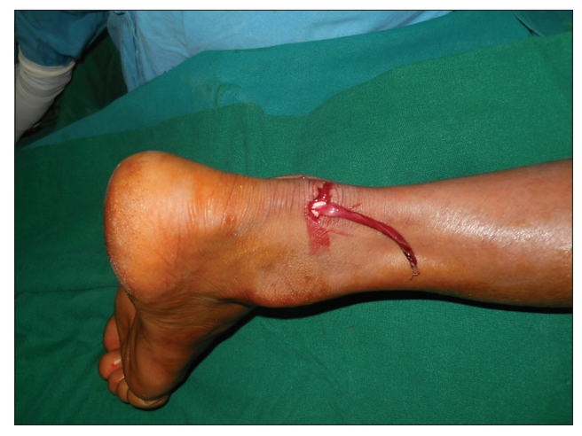
Figure 1 : Patient presenting with a small wound over the posterior aspect of the heel with soft tissue protruding through tendoachillis

She has completed 3 years of follow-up and the recovery so far is satisfactory. Except mild hallowing of the instep