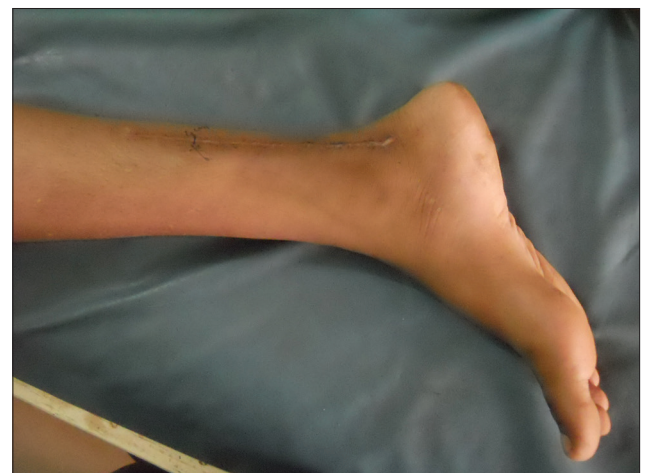
Figure 4: Picture taken after 3 weeks. The mark indicated the level of tunnels at that time. The wound has healed well