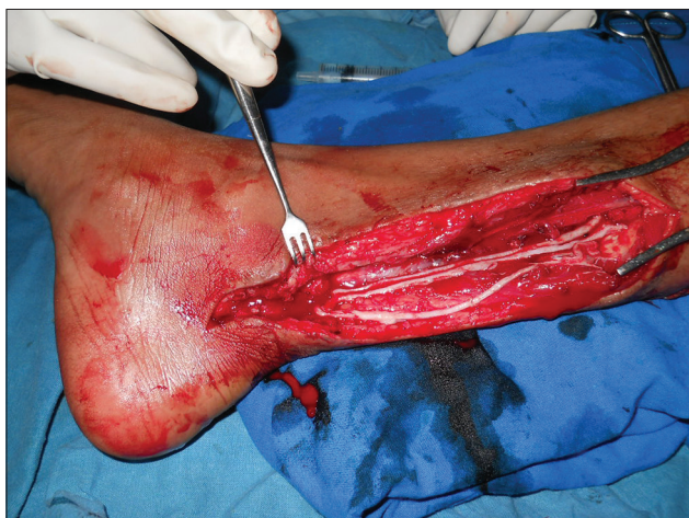
Figure 3: Photograph taken during secondary reconstruction. The nerve being reconstructed with sural nerve cable grafts from the same leg