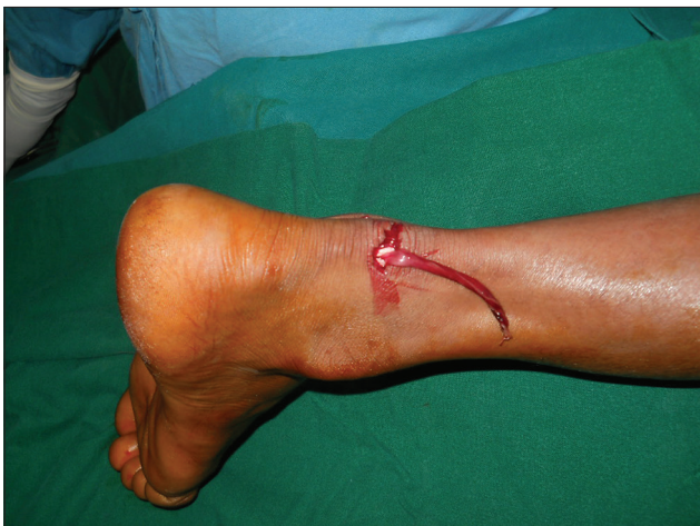
Figure 1: Patient presenting with a small wound over the posterior aspect of the heel with soft tissue protruding through tendoachillis

The actual site of nerve injury was much higher than perceived site of injury, possibly a relatively fixed point like a muscular branch and is difficult to predict. [9] This