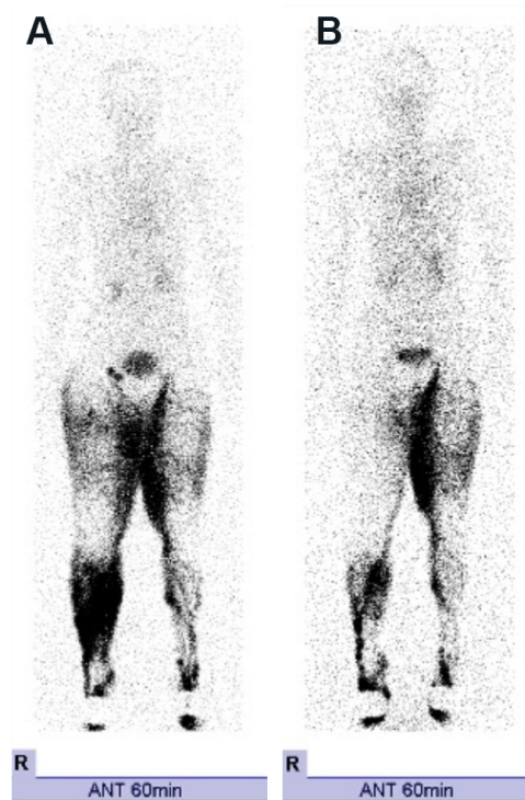
Figure 2. Comparison of lymphoscintigraphy before and after the treatment. (A) 1 month before LVA; (B) 6 months after LVA. Note that the dermal backflow over the right lower leg and the thigh diminished and the lymphatic pathways became distinct after LVA followed by perioperative reduction treatment. LVA: Lymphaticovenular anastomosis.

reduced lymphatic pressure, which usually deteriorates in lymphedema in the first place. According to a systematic review conducted by Tourani et al. [21] , the overall long-term patency rate of LVA was discouraging in animal studies due to the gradual decline of the pressure gradient across the anastomosis