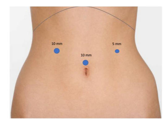
Figure 1. Trocars placement.