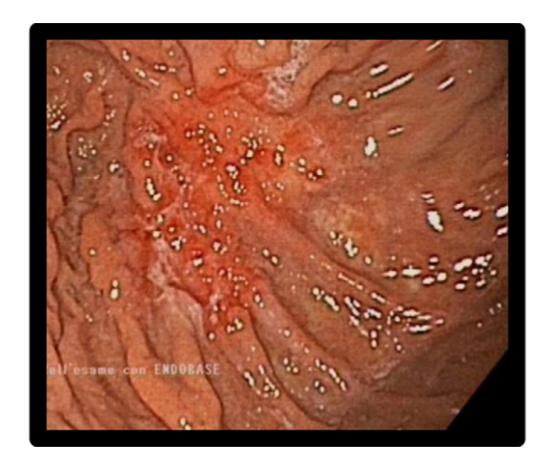
Figure 1. Endoscopy showing localized lesion at gastric corpus. Biopsy confirmed the presence of gastric metastasis from breast cancer

the incidence of lobular carcinoma metastasis is higher in organs such as gastrointestinal system (4.5% vs. 0.2% in ductal carcinoma); gynecologic organs (4.5% vs. 0.8%); peritoneum-retroperitoneum (3.1% vs. 0.6%); bone marrow(21.2% vs. 14.4%). We found 42 cases with gastric metastasis from lobular carcinoma, whereas 16 cases were related to ductal carcinoma. The propensity of lobular breast cancer to give metastasis seems to be correlated with mutations of E-cadherin genes; the impaired function of the produced protein determines loss of adhesion among epithelial cells. Cells are initially separated from each other so that they can invade the surrounding tissue and then enter in the lymphatic system or in the bloodstream, leading to the progression of metastatic disease<sup>[63,64]</sup>.