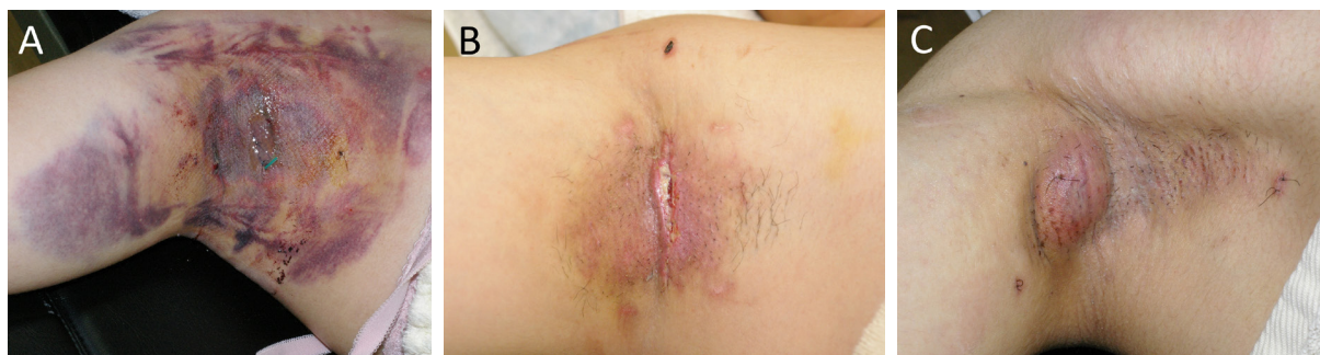
Figure 3. Examples of postoperative complications: A: hematoma after open excision; B: wound dehiscence after open excision; and C: seroma after closed curettage by the suction-assisted cartilage shaver system

the outcomes of microwave coagulation, suction curettage, and laser coagulation. They concluded that microwave coagulation and suction curettage were superior to laser coagulation, but the complication rate of suction curettage was much higher than the rates of the other two procedures. In the English-language literature, however, no studies have compared the two major surgical treatments (suction curettage and conventional open surgery). We believe that our study was meaningful because we compared the outcomes of these two procedures, 90% of which were performed by a single surgeon.