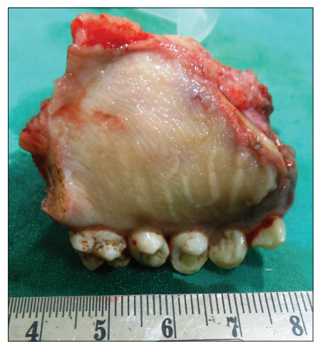
Figure 4: Partial maxillectomy was carried out and resection of the complete lesion was done

The BFP was expanded and sutured with 4-0 vicryl to the underlying wound. A saframycin based oral pack was secured over the palate with 3-0 vicryl suture for primary protection for 1 week till the epithelization begins, and strict soft diet was followed [Figure 5]. The patient was kept on periodic recall every 2 months during the 1 year follow-up [Figure 6].