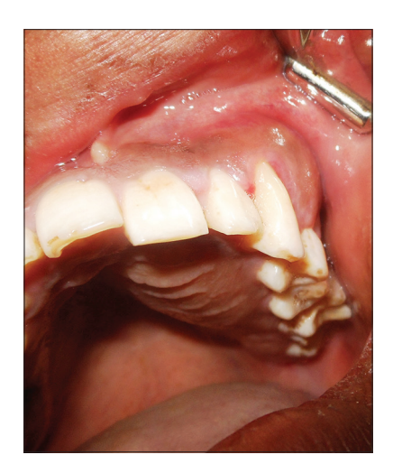
Figure 1: Intraorally, swelling of 3 cm \times 3 cm in size in the left anterior maxilla with intact mucosa causing bicortical expansion

After confirmation of diagnosis as DA from the clinical, histological, and radiological examination, planning for surgical resection and reconstruction was done. Under general anesthesia and using a maxillary vestibular approach, incision was placed in the left buccal vestibule extending from the left central incisor to left second molar region, exposure of the lesion was done. Extraction of left upper central incisor and left second molar was done and osteotomy cut was performed on the buccal side from the extraction socket and connected to each other with a horizontal osteotomy cut just beneath the infraorbital foramen protecting infraorbital neurovascular bundle. On palatal side, incision was given from the socket of left upper central incisor to left second molar with an electrocautery, and a vertical osteotomy cut was performed. Partial maxillectomy with