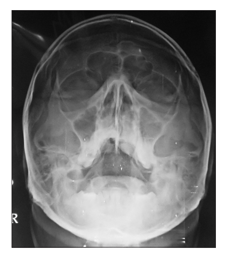
Figure 2: Water's view showed haziness over the left maxillary sinus