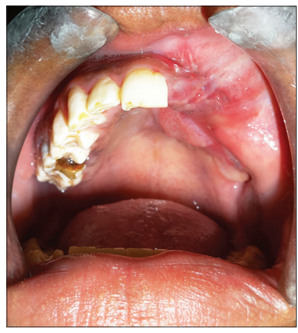
Figure 6: Postoperative picture after 1 year