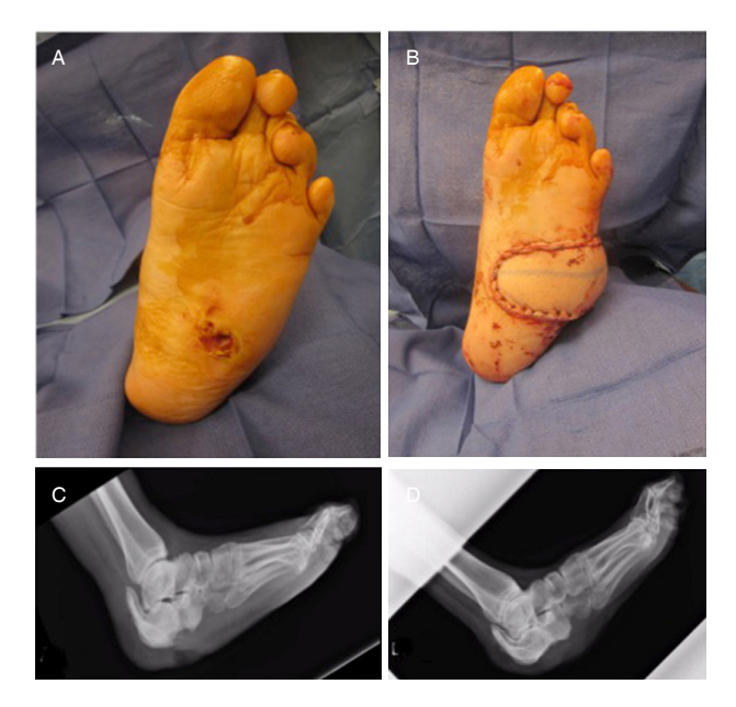
Figure 1. Superficial osteomyelitis managed with suprafascial anterolateral thigh. A patient with Cierny-Mader Class 2 ostomyelitis of the calcaneus. A: A preoperative photo; B: immediate post flap phot; C: pre flap radiography with osteomyelitis; D: six-month follow up photo with clearance of osteomyelitis. The patient was weight bearing at time of follow up

For the purposes of this study, the database was queried in June 2018 for cases performed from January 2015 to December 2017. We excluded muscle flaps and skin-only or fasciocutaneous flaps other than ALT's. Of 84 patients who underwent lower extremity free-tissue with ALT flaps, we excluded 25 individuals without high risk factors. This left 59 patients selected for at least one of the following features: osteomyelitis, Charcot collapse, and critical limb ischemia.