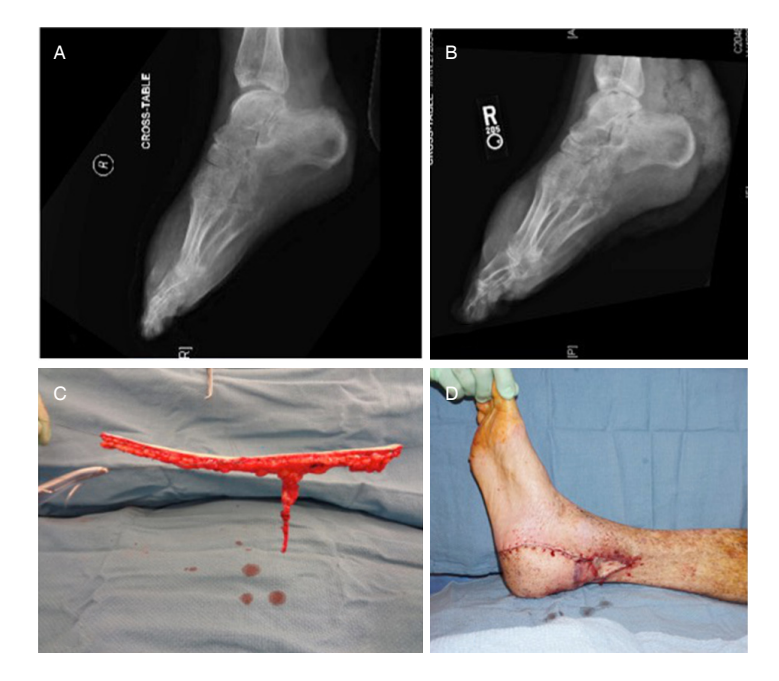
Figure 3. A case of Calcaneal Osteomyelitis treated with superthin anterolateral thigh (ALT) flap. A patient with Cierny-Mader class 3 osteomyelitis with calcaneal and proximal mid-foot erosions seen on (A) preoperative radiography. This required boney debridement and soft tissue coverage with superthin ALT in single-stage; (B) shows postoperative radiography with clearance of osteomyelitis; (C) demonstrating superthin (periscarpal) ALT; (D) after final inset and small skin graft for coverage of the vascular pedicle. This resulted in full-ambulation in normal shoe gear

targeting the sciatic, tibial and peroneal nerves when appropriate. This achieved decreased rates of postoperative narcotic use and shorter post-anesthesia unit stays<sup>[21]</sup>. Additionally an early limb dependency program<sup>[22]</sup> helped patients dangle early in their post-operative course expediting hospital stay, discharge to rehabilitation facilities, and return toward functional ambulation.