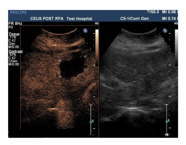
Figure 3. CEUS check after last RFA (2015). CEUS: contrast enhanced ultrasound; RFA: radiofrequency ablation

No signs of HCC recurrence were observed within the 24-week post treatment follow-up. A decrease in the alfa-fetoprotein levels (77 UI/mL to 4 UI/mL) was observed by week 12 (April, 2015), remained so in the following months (July-October 2015). Contrast-enhanced ultrasound showed reduction in the size of the zone of interest to 26 mm (September, 2015).