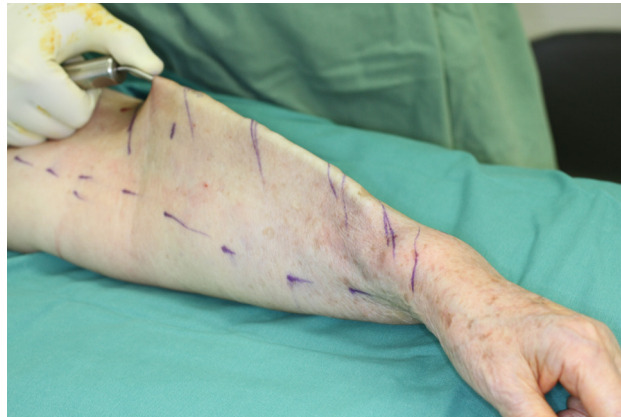
Figure 3. The same patient as in Figure 1: suction-assisted liposuction was performed until the overlying skin could be lifted with ease