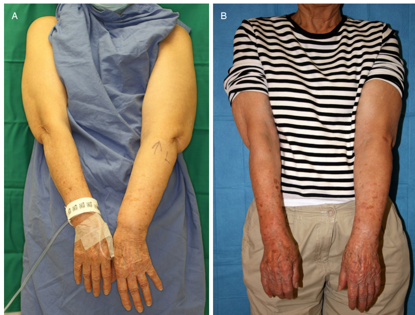
Figure 4. The same patient as in Figure 1: (A) clinical photo before liposuction; and (B) clinical photo 40 months after liposuction. The limb size was maintained with only regular use of Class I compression sleeve. When liposuction is performed in the right patients, i.e., patients with fatty phase of lymphedema, only low maintenance is required for the control of limb size