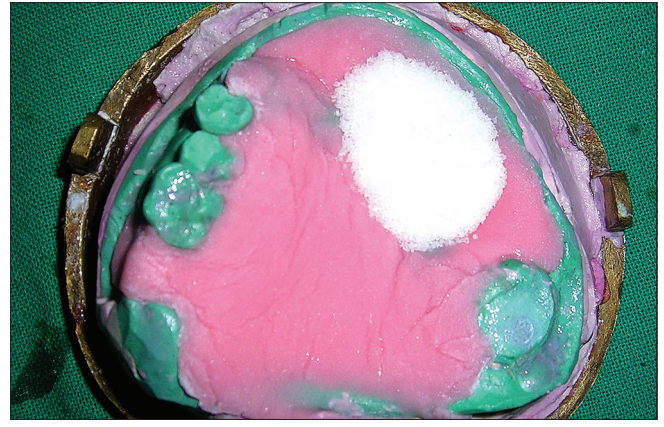
Figure 5: Salt filled into the defect