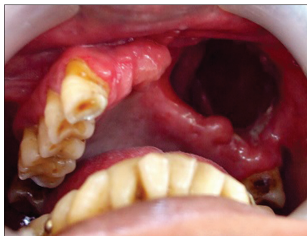
Figure 1: Intraoral view of the maxillectomy defect

Border molding for recording the soft tissue borders of the defect was carried out using a low-fusing impression compound. Additional silicone was used to make a wash impression, and the final master cast was poured. All undercuts on the cast were blocked out with plaster and wax [Figure 2]. The final denture base and occlusal wax rims were prepared to record maxillomandibular relations. After the maxillomandibular jaw relations had been obtained, the record was articulated, and teeth arrangement was performed. On completion, the wax prosthesis was verified at the trial insertion appointment. The wax prosthesis was invested, and the wax was eliminated [Figure 3]. A sheet of plastic based heat cure acrylic polymer in the dough stage was placed over the defect and the palatal area on the master cast. Pressure then applied to the base of the defect resulted in a cup-shaped depression of acrylic polymer over the defect [Figure 4]. Salt was then used to fill the depression [Figure 5]. Another thin sheet of acrylic polymer was placed, and packing was performed with conventional prosthodontic protocols. Finally, three to four holes were drilled on the palatal surface of the prosthesis covering the bulb [Figure 6]. Warm water was injected through the holes to dissolve and eliminate the