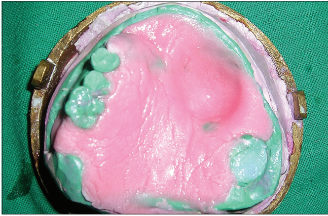
Figure 4: Plastic based polymethylmethacrylate heat cure placed and pressed into the defect