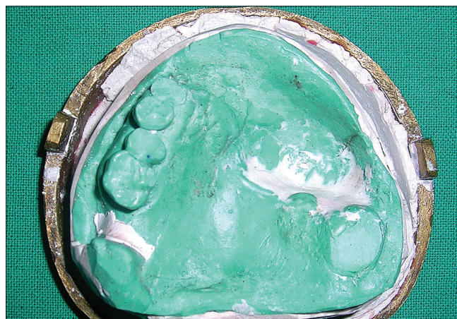
Figure 3: Master cast after elimination of wax

salt present in the bulb [Figure 7], resulting in a hollow space inside the bulb. The holes were sealed with a layer of self-curing acrylic, and final finishing and polishing of the prosthesis was done [Figure 8].