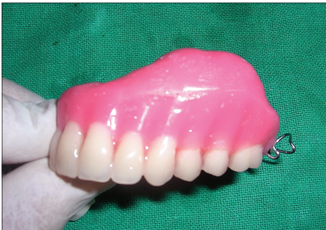
Figure 8: Finished and polished single unit hollow obturator closing the defect