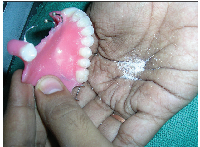
Figure 7: Elimination of salt through the holes