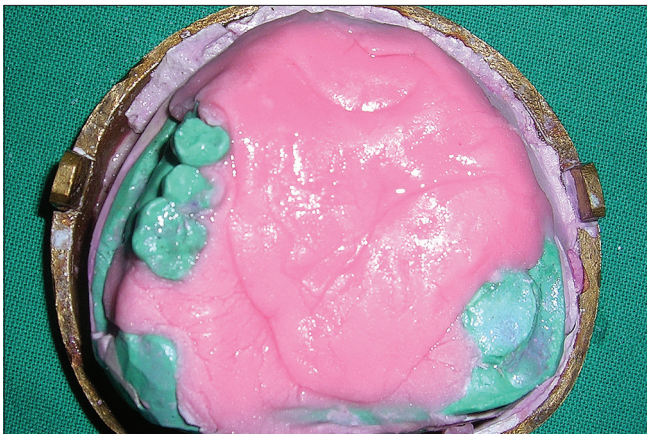
Figure 6: Second layer of plastic-based acrylic placed over the defect