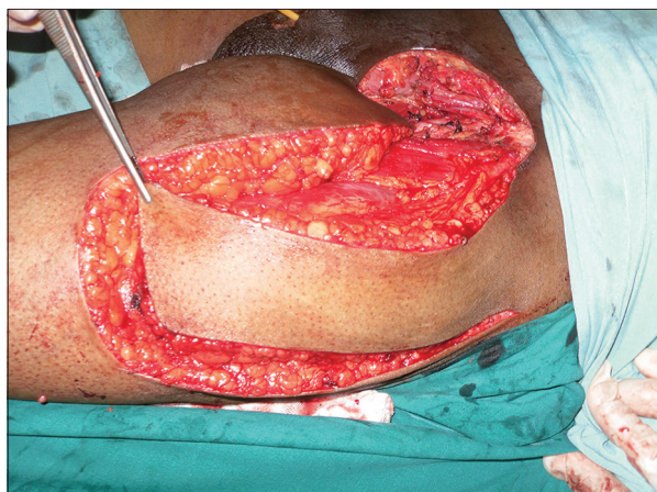
Figure 3: Flap after dissecting all around