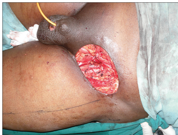
Figure 2: Defect created after inguinal block dissection