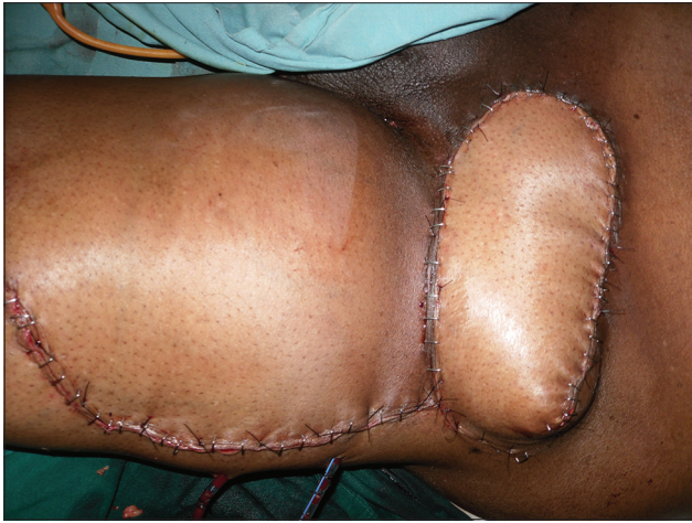
Figure 5: Primary and donor site approximated without tension

flap. We preferred TFL particularly in this case. The dissection could be done through the incision joining inguinal block dissection. The defect created was closed without any tension and with acceptable cosmetic result. A simple upper and medial or rotation of the flap helped us to approximate the donor site and close it primarily [Figures 4 and 5].