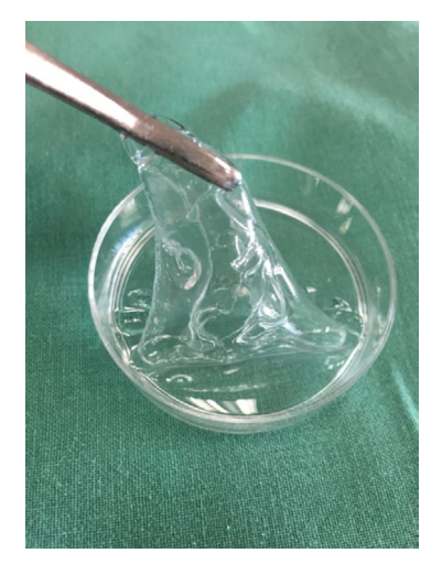
Figure 3: The gross view of cross-linked hyaluronic acid using BDDE at the concentration of 0.8%

HA is synthesized by HA synthesis (HAS) on the cell membrane. And it is the only glycosaminoglycan that is not synthesized in the Golgisome. There are three different HAS in mammals, HAS1, HAS2 and HAS3. The three enzymes are located on different chromosomes, producing HA with different molecular weights<sup>[11]</sup>. The expression of HAS isoenzymes varies under different status of morphogenesis and pathology. For example, HA in infants is of abundant quantity, however, in the process of growing up it is gradually replaced by collagen fibers and proteolycins which accounts for the fact that mature tissue can