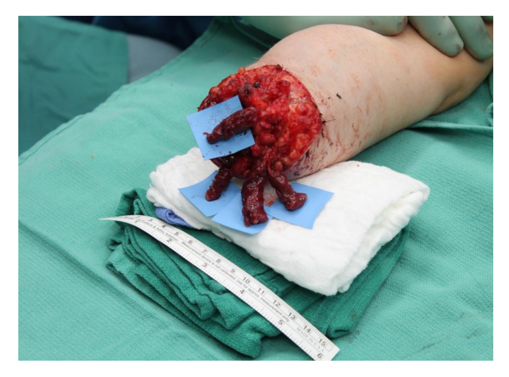
Figure 3. Intraoperative RPNI creation. This patient underwent implantation of four RPNIs, one each for the radial and median nerve and two for the ulnar nerve. RPNI: Regenerative peripheral nerve interface.

peripheral nerves through the RPNI<sup>[15]</sup>. In fact, even in patients with proximal amputations, fascicular RPNIs can be created and utilized to capture signals for intrinsic finger movements. For instance, distinct RPNIs that facilitated individual finger movements were identified in a patient with a shoulder-level amputation<sup>[9]</sup>.