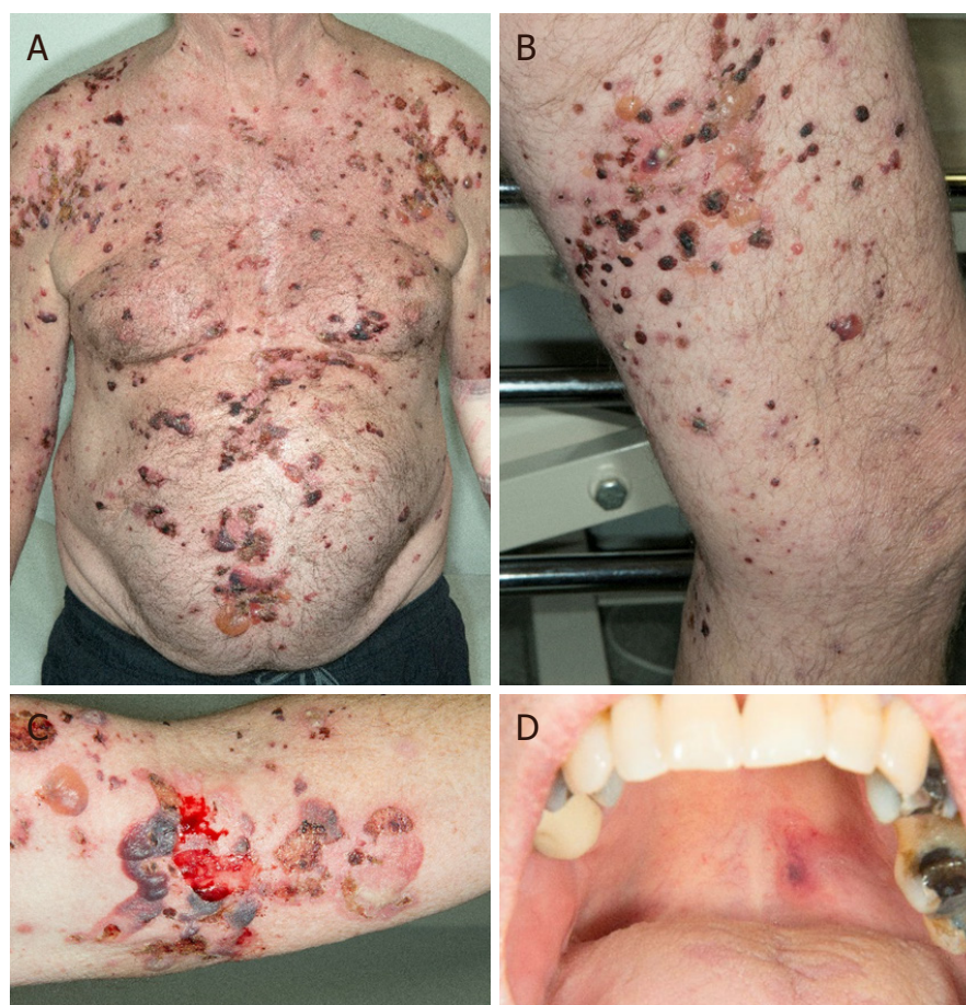
Figure 1. Clinical presentations. Multiple, grouped, large, tense haemorrhagic blisters were seen on the first clinical presentation, which affected the chest, abdomen, inner thighs and upper arms (A, B and C); active blisters and erosions were seen on the roof of the mouth (D)