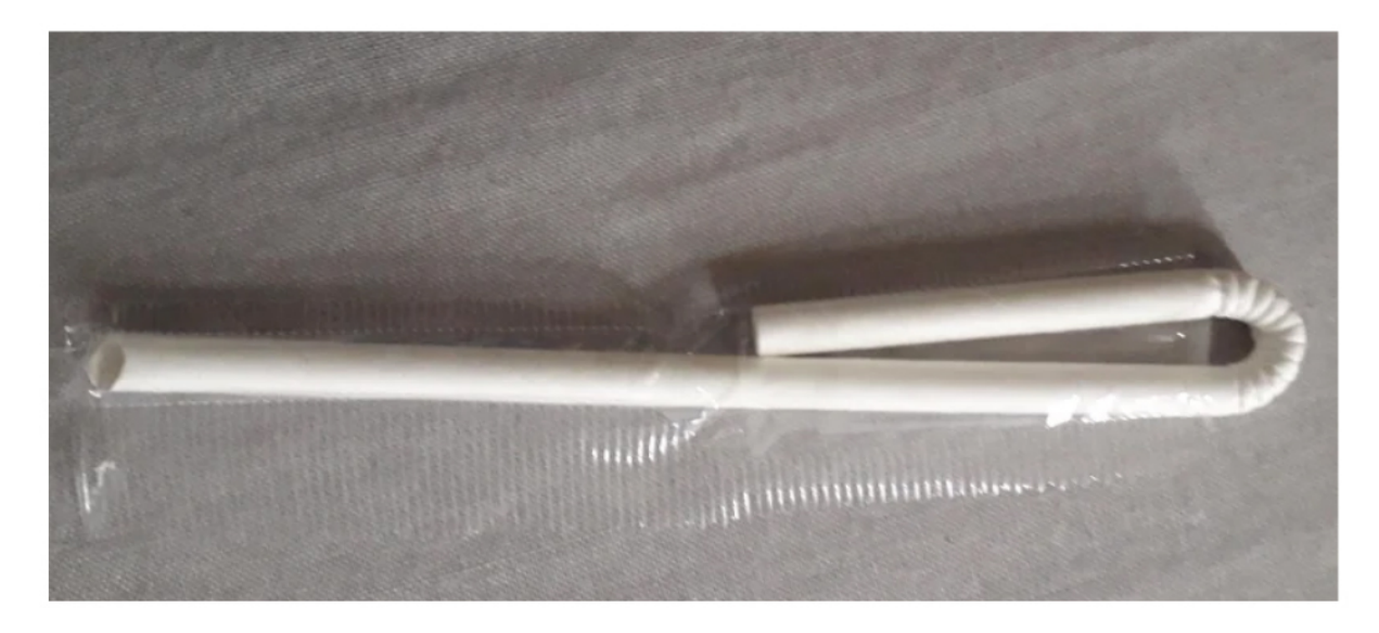
Figure 2. The product of recent symbolic measures enforced in numerous European countries: the plastic-wrapped paper straw.

The industry is the source of the single-use plastic crisis. The continued and ever-increasing production of new fossil-based "virgin" polymers perpetuates and will continuously aggravate the current take-make-waste dynamic of the plastics economy, concomitantly undermining a transition to a "circular" plastic economy and simultaneously impacting waste collection rates, end-of-life management and, ultimately, plastic pollution. Despite these threats and consequences, the plastic industry has, by and large, continued to be permitted to operate with minimal regulation and transparency. This is particularly evident when considering the issue of plastic additives, chemicals whose inclusion in the composition of polymers is frequently not disclosed, and any environmental and/or health potential outcomes cannot be adequately assessed, with regulatory efforts frequently lagging behind<sup>[15]</sup>. This is, effectively, a key part of the problem: it is impossible to manage what cannot be measured, so focusing on real actions aimed at making these plastic producers accountable is essential.