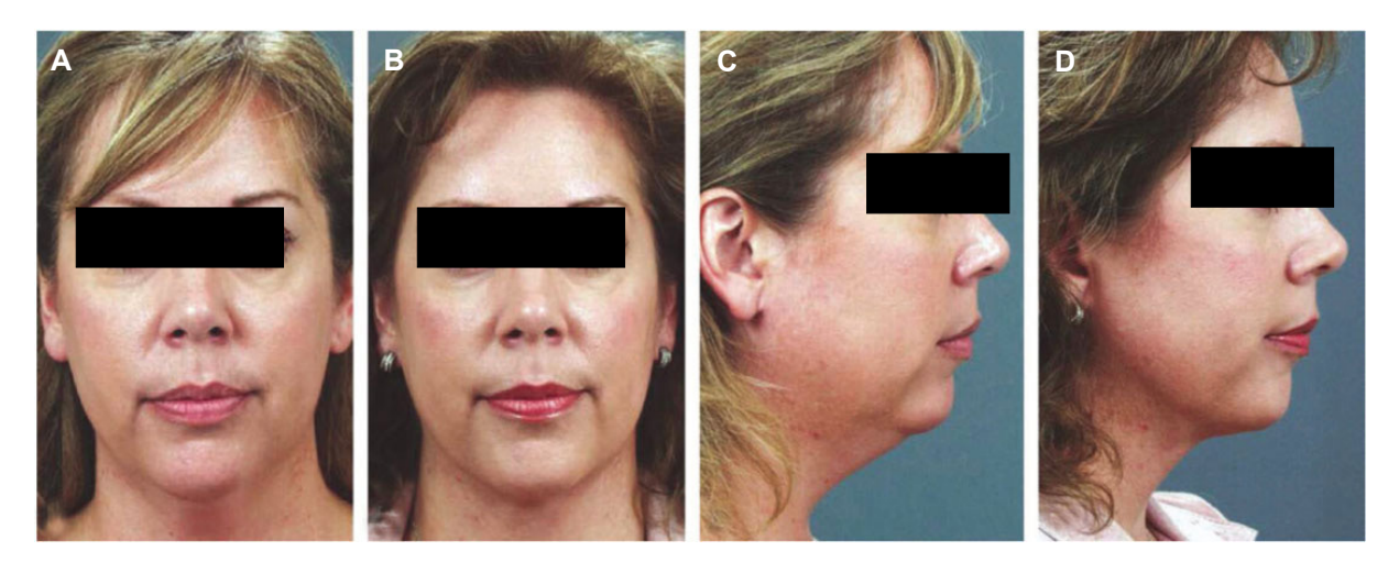
Figure 3. (A, C) Preoperation and (B, D) 4-year postoperation photos following liposuction of the neck without skin excision<sup>(3)</sup>.

Weinstein et al. Plast Aesthet Res 2021;8:11 | http://dx.doi.org/10.20517/2347-9264.2020.192