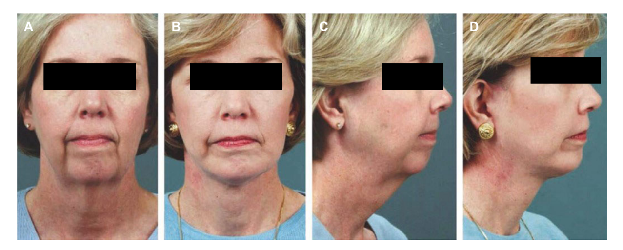
Figure 5. (A, C) Preoperation and (B, D) postoperation photos following facelift and submental neck lift, including deep plane procedures, subplatysmal fat and digastric excision with no subcutaneous fat excision<sup>[3]</sup>.

Weinstein et al. Plast Aesthet Res 2021;8:11 | http://dx.doi.org/10.20517/2347-9264.2020.192