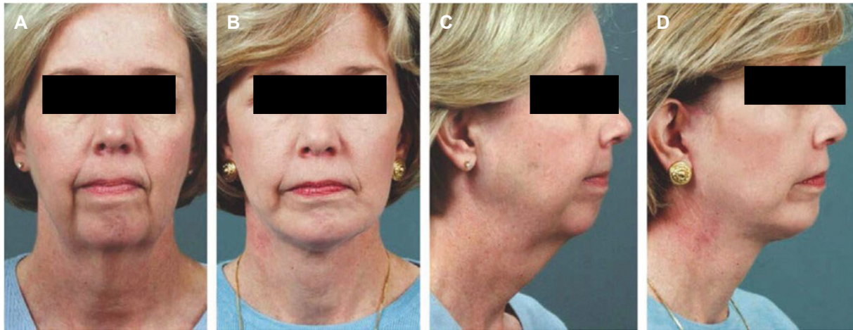
Figure 5. (A, C) Preoperation and (B, D) postoperation photos following facelift and submental neck lift, including deep plane procedures, subplatysmal fat and digastric excision with no subcutaneous fat excision [31] .