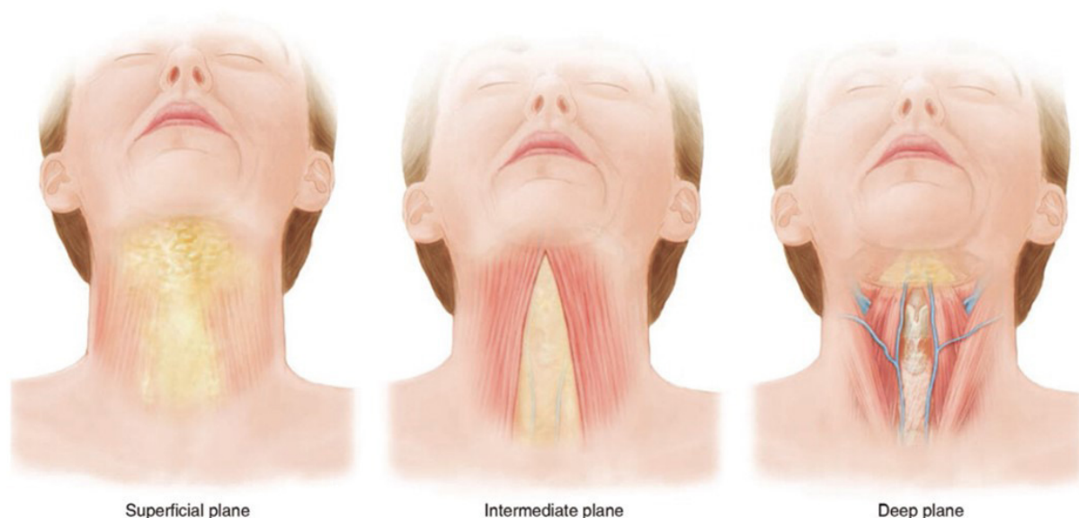
Figure 1. Three anatomical layers of the neck [3] .