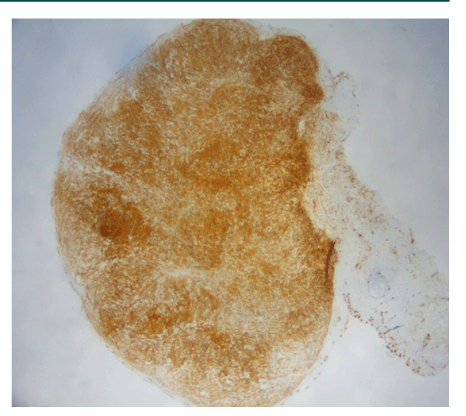
Figure 3: CD34: strong, diffuse immunostaining of entire lesion (ABC perox, ×10)

positivity, and negativity for both S100 and smooth muscle actin. Hence, a diagnosis of solitary fibrous tumor was formulated.