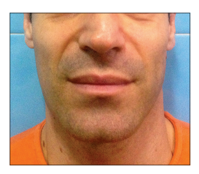
Figure 4: After 2 more weeks the swelling gradually disappeared