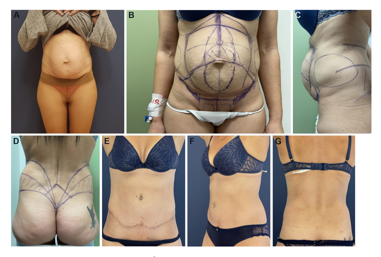
Figure 1. A 36-year-old woman with BMI of 22 kg/m<sup>2</sup> and four caesarean sections, who underwent lipoabdominoplasty, before (A-D) and nine months after (E-G) surgery. Notice the correction of the large diastasis and the definition of the abdomen, waistline, and back.