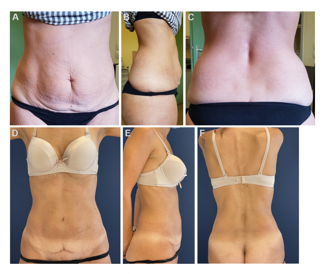
Figure 3. A 35-year-old woman with BMI of 24 kg/m<sup>2</sup> who underwent lipoabdominoplasty, before (A-C) and 2.5 years after (D-F) surgery. Notice the definition of the abdomen, waistline and back.

Liposuction of the thoracoabdominal area, superior and lateral to the flap, debulks an area which is not treated by abdominoplasty alone. In fact, cannula undermining has substituted the traditional flap undermining, preserving the vascular supply of the abdominal flap, while permitting its debulking, without increasing the risk of necrosis or complications. Sozer et al. <sup>[17]</sup> showed in a series of 1000 patients that applying widespread circumferential liposuction with standard abdominal flap undermining up to the costal margins is safe and associated with improved aesthetic results. Similar results, concerning safety and patient satisfaction, have been also reported following concurrently performing liposuction and abdominoplasty<sup>[18-20]</sup>. Roostaeian et al. <sup>[21]</sup> conducted a prospective study in 18 patients, employing SPY fluorescent imaging (LifeCell Corp, Bridgewater, NJ), which showed that the rates of intraoperative abdominal flap perfusion or postoperative complications are not significantly different between lipoabdominoplasty and traditional abdominoplasty.