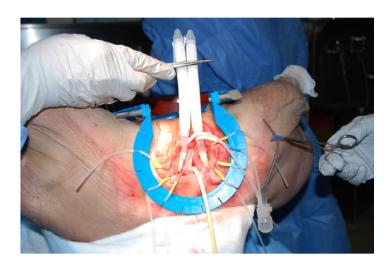
Figure 5. Placement of IPP by modification of AdVance Male Sling. Successful anchoring of IPP using male slings in a trans-obturator fashion. IPP: Inflatable penile prosthesis.