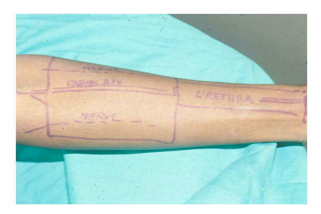
Figure 2. Preoperative skin drawings of radical-forearm free flap with neourethra, neoglans, and radial artery illustrated as mapping of surgical planning.

currently being used are the malleable non-inflatable rod, two-piece IPP (Boston Scientific, Malborough, MA, USA), three-piece IPP (Boston Scientific, Malborough, MA, USA and Coloplast, MN, USA), and three-piece ZSI 475 FtM implant (Zephyr Surgical Implants, Geneva, Switzerland). While the malleable implant is less complex and less costly than its IPP counterpart, its constant rigidity makes it difficult to conceal, and there is always the potential risk for distal erosion secondary to pressure necrosis of the flap. Hence, the most common type of implant used is the three-piece IPP (75% of implants)<sup>[13]</sup>. Although a three-piece IPP comes with two cylinders, many are using a single cylinder, mainly due to the limitation of the neophallus girth and the absence the native tunica that exists.