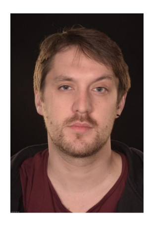
Figure 4. Preoperative image of patient 7, who had a Delayed Frontal Branch Facial Nerve Repair.

The cutaneous course of the frontal branch runs along the Pitanguy line, which is 0.5 cm from the tragus to 1.5 cm lateral to the supraorbital rim<sup>[1]</sup>. The temporal branch of the facial nerve (also known as the frontal branch) typically emerges from the parotid as the zygomatic frontal trunk, which then divides into terminal branches of zygomatic and frontal branch, about 1 to 2 cm from the exit point of the parotid gland<sup>[2]</sup>. The frontal branch travels over the zygomatic arch, where it lies deep to the SMAS above the zygomatic arch. At this point, the frontal branch has an additional fascial layer protecting it, called the parotid temporal fascia, which is separate from the SMAS.