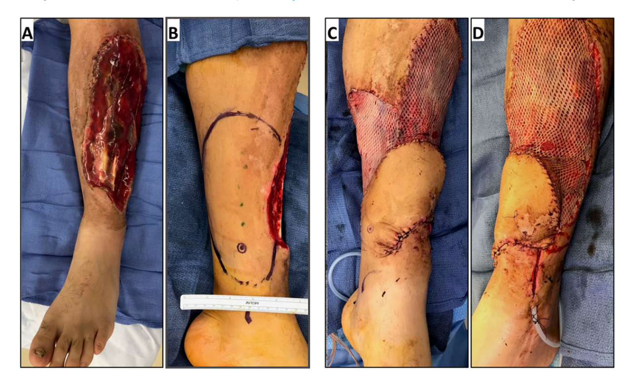
Figure 2. A: adult male following degloving injury to left lower extremity; B: preoperative marking for posterior tibial artery perforator propeller flap; C: immediate postoperative result, medial view; D: immediate postoperative result, lateral view