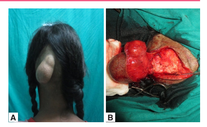
Figure 2: Preoperative (A) and intra-operative (B) view of a dermoid cyst of occiput

This study included all the patients of dermoid and epidermoid cysts who visited D. Y. Patil Dental College and Hospital, Pune between January 2010 to January 2015. Twenty-one patients (12 females and 9 males) were diagnosed clinically with dermoid/epidermoid cyst and confirmed by fine-needle aspiration cytology. Giant cysts were present on the anterior scalp in 5 patients [Figure 1], on the posterior scalp in the occipital region in 3 patients [Figure 2], on the frontal bone in 3 patients, on the lateral orbital margins in 9 patients [Figure 3], and 1 patient had a dermoid cyst intraorally in the upper lip [Figure 4]. The age of the patients ranged