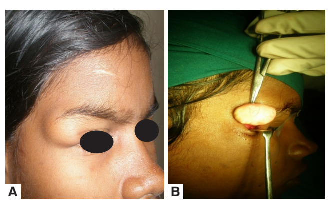
Figure 3: Preoperative (A) and intra-operative (B) view of a dermoid cyst of lateral orbital margin

cyst in the oral cavity, lower lip, or upper lip. [7] Giant epidermoid cysts are rare and they present in the scalp.