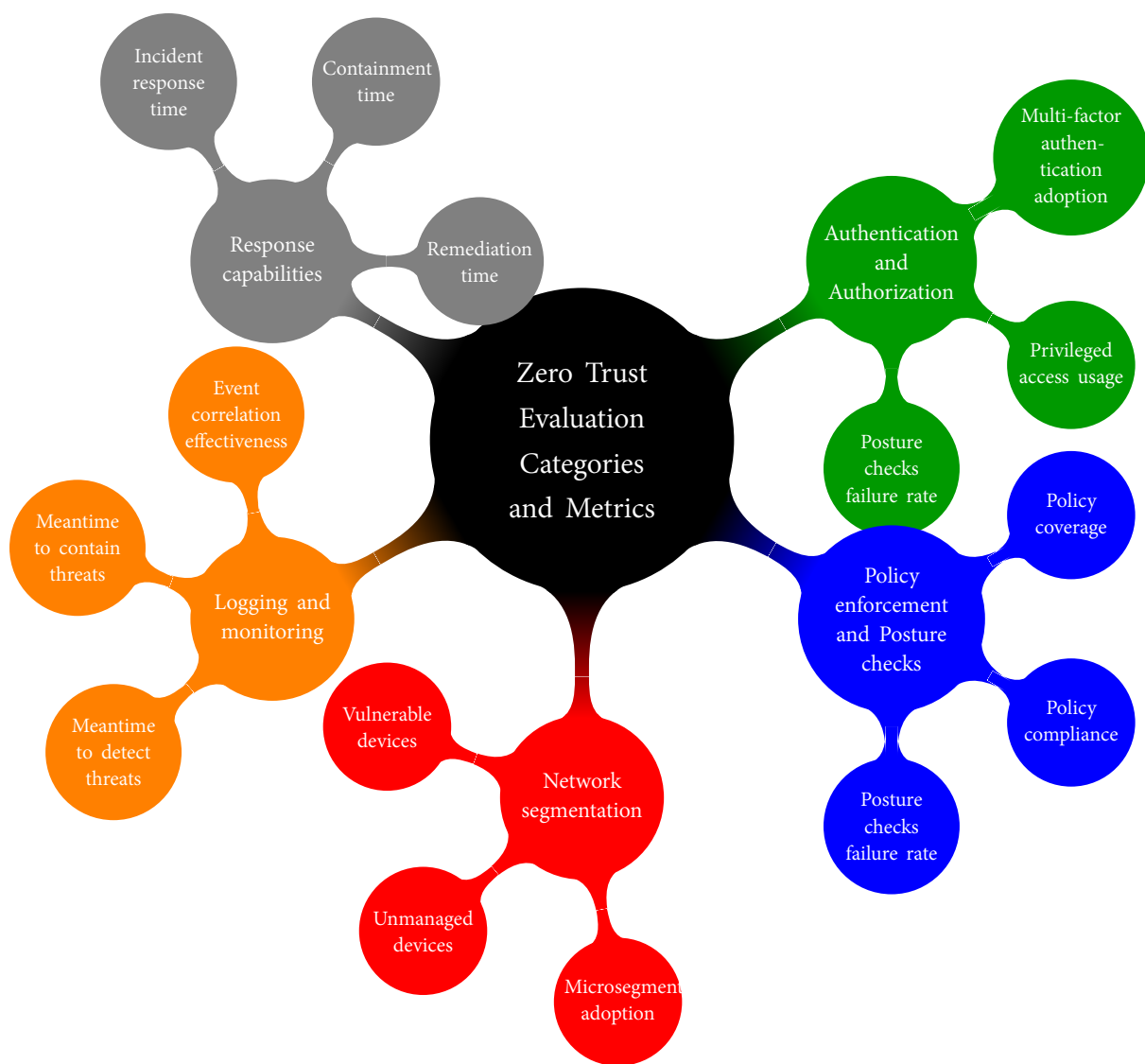
Figure 3. Example for zero trust evaluation approaches and metrics.

registration. An additional metric is a vulnerable device that assesses the number of devices with vulnerabilities identified through the posture checks mentioned above.