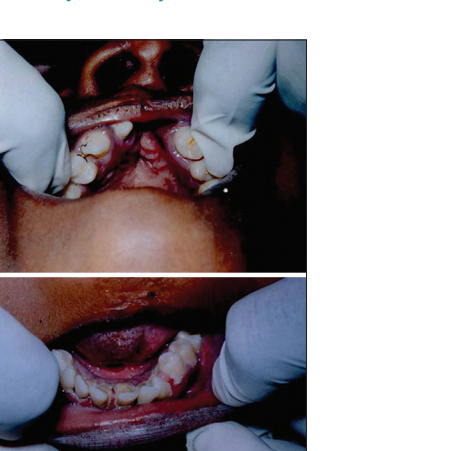
Figure 3 : Introral view. (a) Maxillary arch showing constricted maxillary arch and nasoalveolar fistulae; (b) mandibular arch showing protrusive mandibular anteriors and inflamed gingiva