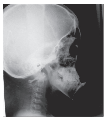
Figure 5: Lateral cephalogram demonstrating a high mandibular angle with a clockwise rotation, midface retrusion and the shadow of ventricular stunt

with education should improve the oral hygiene status of the patient. A series of surgical treatments including alveolar bone grafting, Lefort I osteotomy and maxillary advancement, followed by rhinoplasty and pharyngoplasty was suggested. The need for extensive orthodontic intervention, speech therapy and an additional ophthalmic intervention were also emphasized.