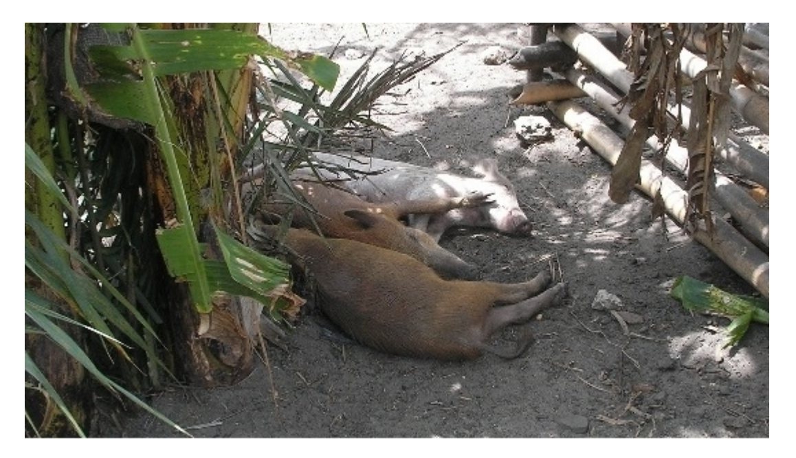
Figure 1. Free-roaming pigs resting on a compound in the community (before intervention).

The follow-up cross-sectional study was done during the high transmission season (dry season 2007). We examined the participants clinically for the presence of tungiasis on legs, feet, hands, and arms, using the baseline study diagnostic criteria<sup>[23]</sup>. Similarly, signs and symptoms associated with acute and chronic tungiasis were documented.