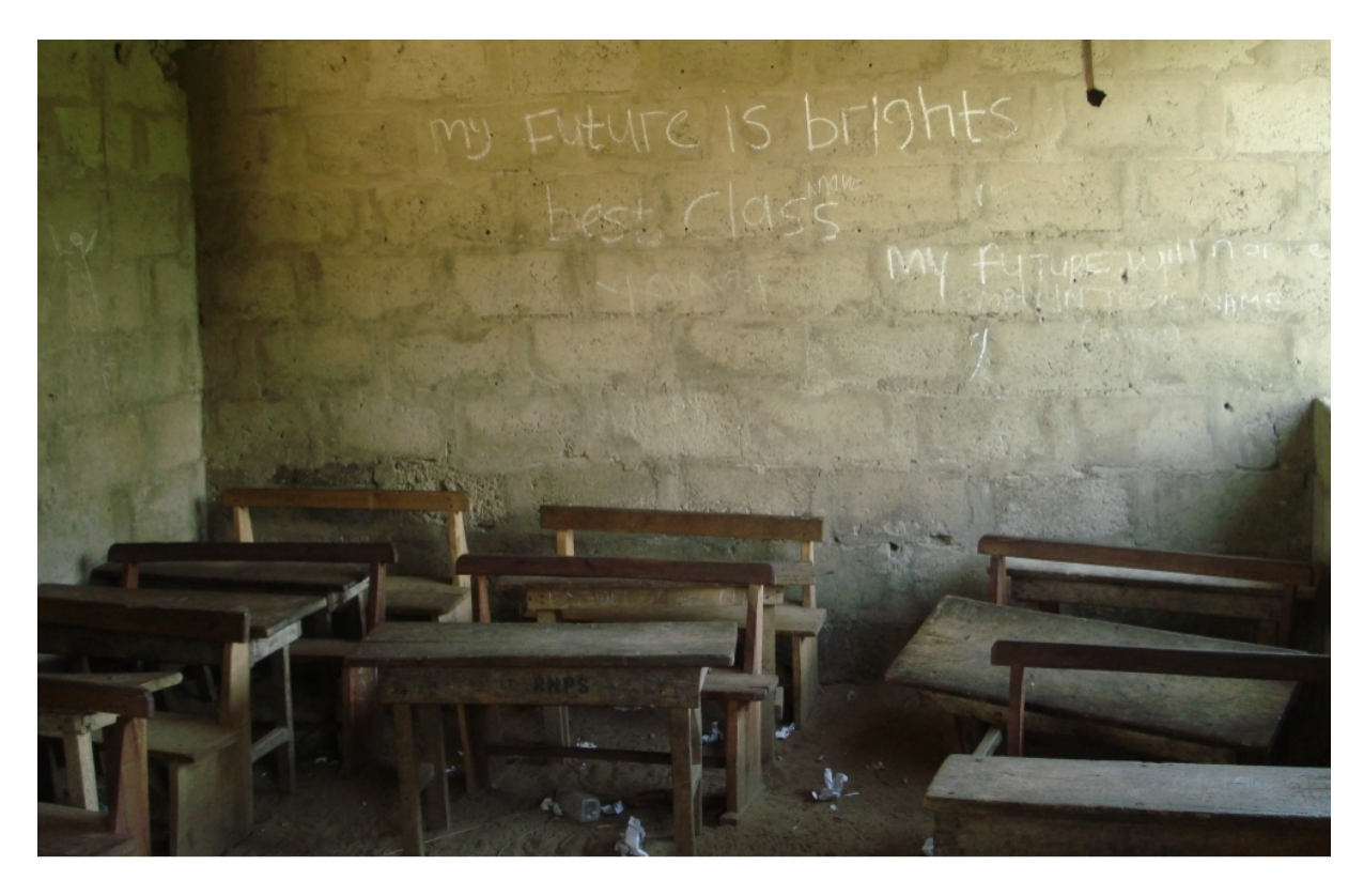
Figure 2. Local school with sandy floor, serving as breeding site for Tunga penetrans parasites (before intervention).

and referred to respective health services, especially in the case of severe infestation.