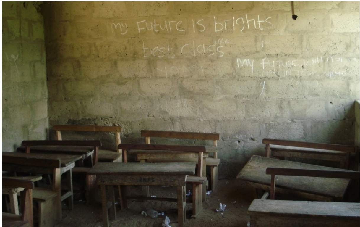
Figure 2. Local school with sandy floor, serving as breeding site for Tunga penetrans parasites (before intervention).

and referred to respective health services, especially in the case of severe infestation.