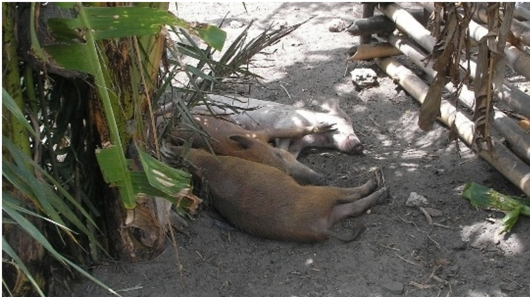
Figure 1. Free-roaming pigs resting on a compound in the community (before intervention).

The follow-up cross-sectional study was done during the high transmission season (dry season 2007). We examined the participants clinically for the presence of tungiasis on legs, feet, hands, and arms, using the baseline study diagnostic criteria [23] . Similarly, signs and symptoms associated with acute and chronic tungiasis were documented.