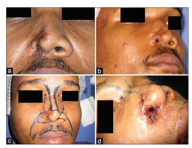
Figure 1: Case 1. Right ala destruction and nostril stenosis. (a) Frontal view, (b) oblique view, (c) preoperative landmark of aesthetic subunits, (d) immediate postoperative correction of the stenosis with Z-plasty and skin grafting

A 29-year-old man presented with a nasal deformity caused by paracoccidioidomycosis, which affected the right ala leading to the nostril stenosis. In a preliminary stage, the right nostril was opened with a Z-plasty and skin grafting was performed [Figure 1]. After 4 months, he underwent resection of the scarred area to construct the original defect using a three stage paramedian folded forehead flaps to resurface the lining and nasal subunits [Figure 2]. The cartilaginous support was achieved by a conchal cartilage graft performed in the second stage.