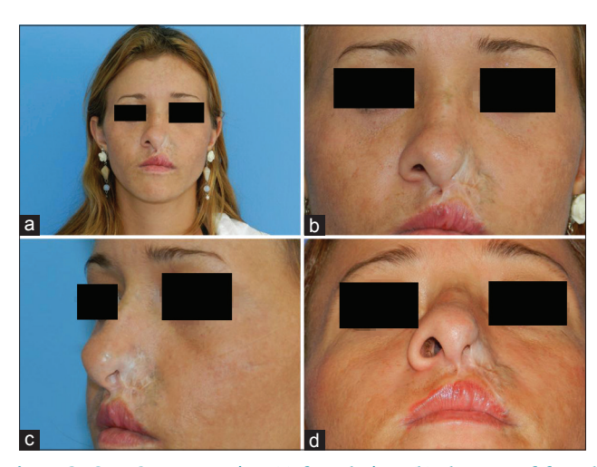
Figure 3: Case 2. Preoperative: (a) frontal view, (b) close up of frontal view showing upper lip retraction and deformity of left ala, (c) oblique view, (d) basal view