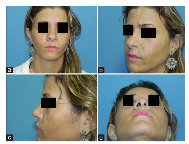
Figure 5: Case 2. Postoperative (4 months) after the expanded forehead flaps in two stages. (a) Frontal view, (b) oblique view, (c) lateral view, (d) base view