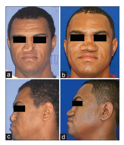
Figure 6: Case 3. Preoperative. (a) Frontal view, (c) lateral view. Postoperative (8 months) after the last procedure (three-stage forehead flap). (b) frontal view, (d) lateral view

The airway patency is restored by excising the scar tissue and releasing retraction. Remaining excess tissue can be used as a flap to increase the nasal lining or to open the airway instead of being discarded. The nose should be rebuilt in a late stage following the principle