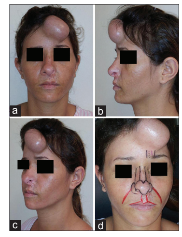
Figure 4: Case 2. Postoperative view after a preliminary stage including expansion of the forehead, correction of retraction of the upper lip and left nostril opening. (a) Frontal view, (b) lateral view, (c) oblique view, (d) frontal view with the landmarks