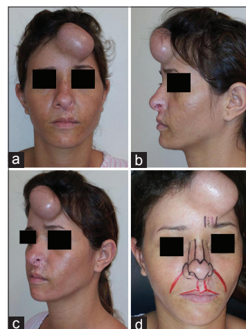
Figure 4: Case 2. Postoperative view after a preliminary stage including expansion of the forehead, correction of retraction of the upper lip and left nostril opening. (a) Frontal view, (b) lateral view, (c) oblique view, (d) frontal view with the landmarks