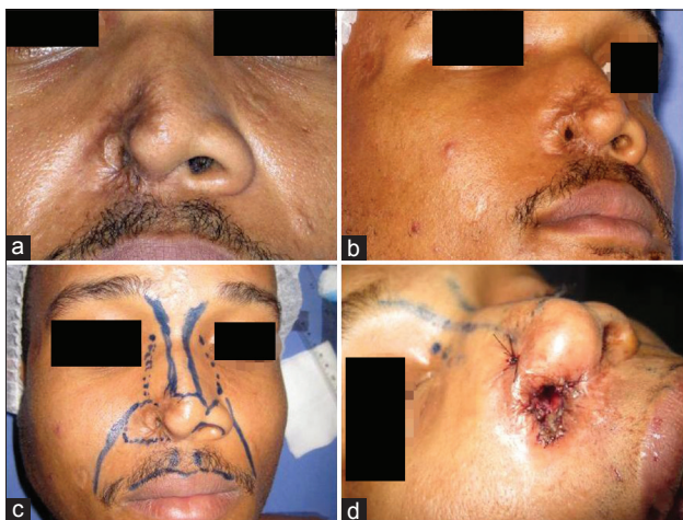
Figure 1: Case 1. Right ala destruction and nostril stenosis. (a) Frontal view, (b) oblique view, (c) preoperative landmark of aesthetic subunits, (d) immediate postoperative correction of the stenosis with Z-plasty and skin grafting

A 29-year-old man presented with a nasal deformity caused by paracoccidioidomycosis, which affected the right ala leading to the nostril stenosis. In a preliminary stage, the right nostril was opened with a Z-plasty and skin grafting was performed [Figure 1]. After 4 months, he underwent resection of the scarred area to construct the original defect using a three stage paramedian forehead flaps to resurface the lining and nasal subunits [Figure 2]. The cartilaginous support was achieved by a conchal cartilage graft performed in the second stage.