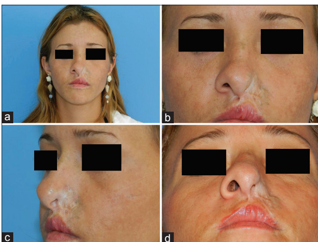
Figure 3: Case 2. Preoperative: (a) frontal view, (b) close up of frontal view showing upper lip retraction and deformity of left ala, (c) oblique view, (d) basal view