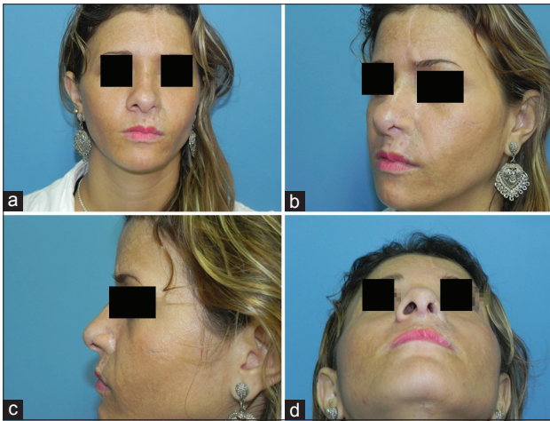
Figure 5: Case 2. Postoperative (4 months) after the expanded forehead flaps in two stages. (a) Frontal view, (b) oblique view, (c) lateral view, (d) base view