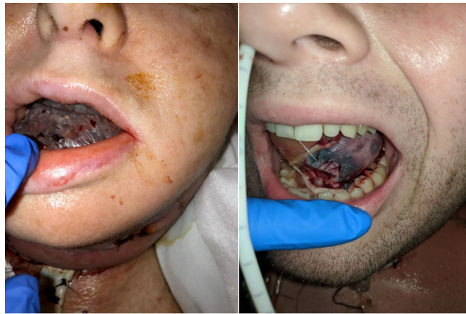
Figure 2. Examples of venous congestion of free flaps.

The usage of topical nitropaste in addressing reconstructive complications is gaining attention. This agent plays a role in vasodilation and relaxation of smooth muscles, predominantly benefiting the venous system. Existing evidence suggests that applying up to 20% topical nitropaste can aid in flap success. Furthermore, it exhibits the potential to reduce thrombosis, enhance platelet aggregation, and prevent vasospasms. Research has indicated a reduction in flap loss and necrosis along with an increase in the viable tissue when topical nitropaste is employed. However, it is important to note that these findings require further substantiation and more research into its applicability, particularly concerning head and neck flaps [52] .