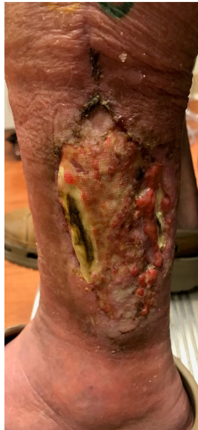
Figure 3. Tendon exposure and loss of skin graft are demonstrated on a fibular donor site.

Once tissue necrosis or poor healing is noted postoperatively, debridement to remove dead tissue from a wound may be necessary to prevent infection and improve epithelialization. This can be done surgically, mechanically (although this is more painful and nonselective), or enzymatically (which may be uncomfortable for a patient). Hydrosurgery is an avenue of debridement to consider, using a handpiece with a nozzle to deliver pressurized saline water to remove dead tissue; however, this is more commonly used for burn wounds and its applicability to reconstructive surgeries is still unclear [60] . Larval or maggot debridement therapy has been described, but it is aversive. Maggots release secretions with proteolytic digestive enzymes that dissolve dead tissue and also contain antimicrobial elements [61] .