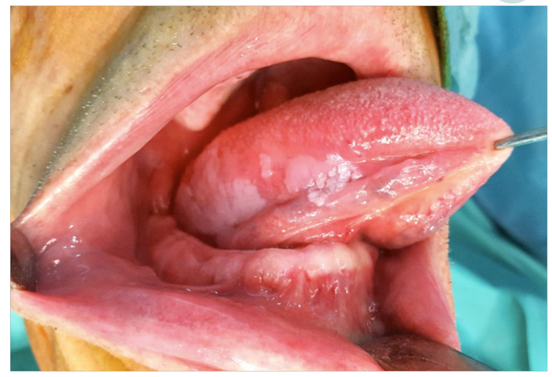
Figure 1: Clinical Stage I (T1N0M0) squamous cell carcinoma of the tongue

needs to be entered for excision of the primary tumor or reconstruction of the surgical defect, a neck dissection needs to be performed.<sup>[6-10]</sup> Currently, management of the clinically negative (cN0) neck in patients whose tumor can be resected transorally remains controversial.<sup>[11-15]</sup> In general an elective neck dissection (END) is justified if the estimated risk of occult lymph node metastases exceeds 15-20%.<sup>[16-20]</sup>