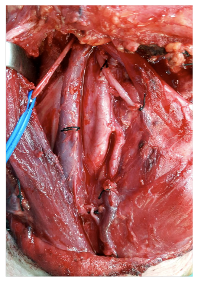
Figure 3: Completed selective supraomohyoid neck dissection, with extirpation of fibro-fatty tissue and lymph neck nodes from levels I to III, while preserving the sternocleidomastoid muscle, accessory spinalis nerve and internal jugular vein

frequently in head and neck cancer patients.<sup>[48]</sup> Therefore, it is challenging to optimize management of the neck in T1-T2 oral cancer and tailor management in the individual patient.