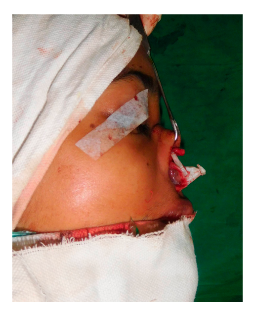
Figure 3. Picture in lateral view. Once the required columella labial angle is set, the tent pole graft is sutured to the dorsum to fix it