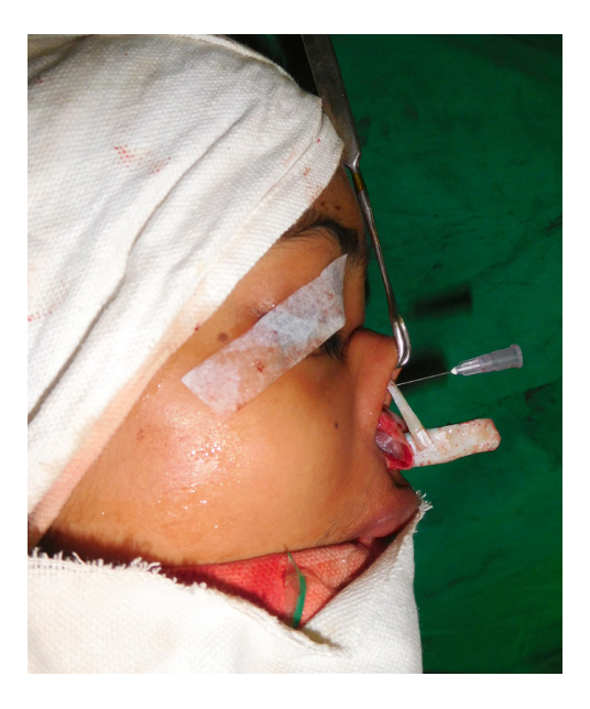
Figure 1. Picture in lateral view of a patient who underwent rhinoplasty, showing temporary fixation of the tent pole graft to set the columella labial angle using needle